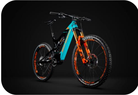
Transportation Safety Reforms