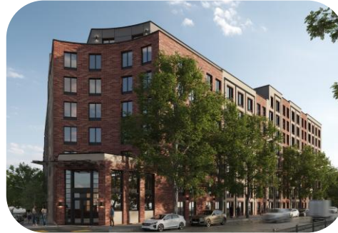
Affordable Housing/Homelessness Funding Stability