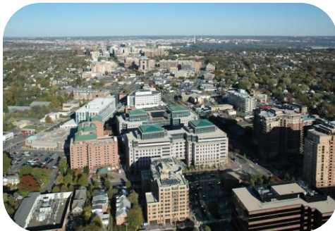
SB 79 (Wiener, 2025) Clean Up