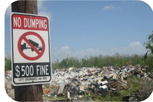
Illegal Dumping Prevention and Mitigation