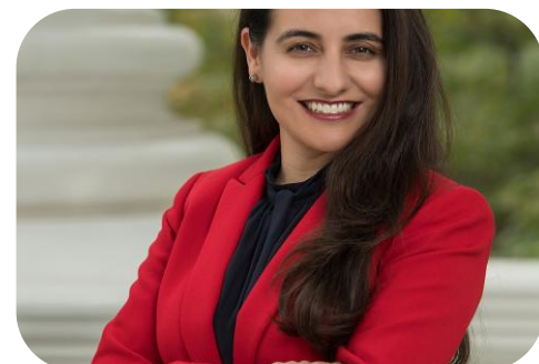
New Leadership and Administration Changes