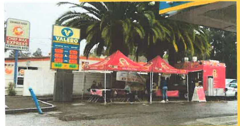
(W. Tennyson Rd)