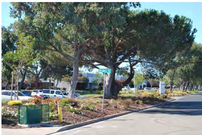
Uniform landscape palette establishes streetscape character and complements adjacent property landscaping along the street.