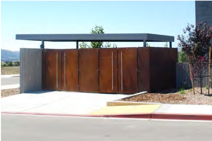
Trash enclosure providing pedestrian entries enhances ease of use.