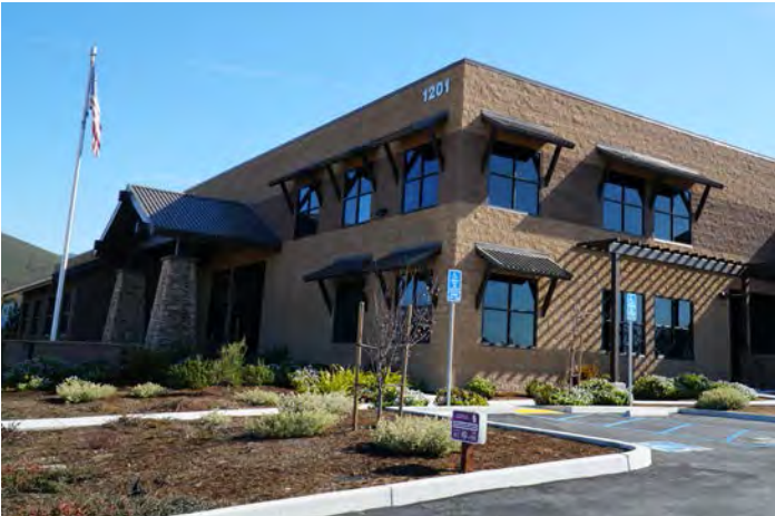
Articulation and detailing continue on side elevation through use of windows, awnings, and other detailing.