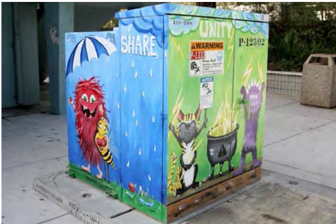
Utility equipment unable to be screened has been enhanced through an art mural.