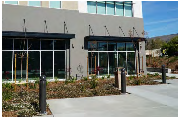
Low, bollard light fixtures placed to provide lighting within pedestrian areas.