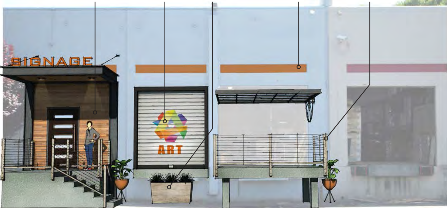
Street facing facade improvements that could occur to create and enhance visual interest.