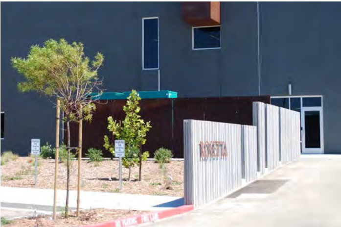
Wall and fencing designed as integral part of a site through continuation of building materials, with landscape minimizing visual monotony.