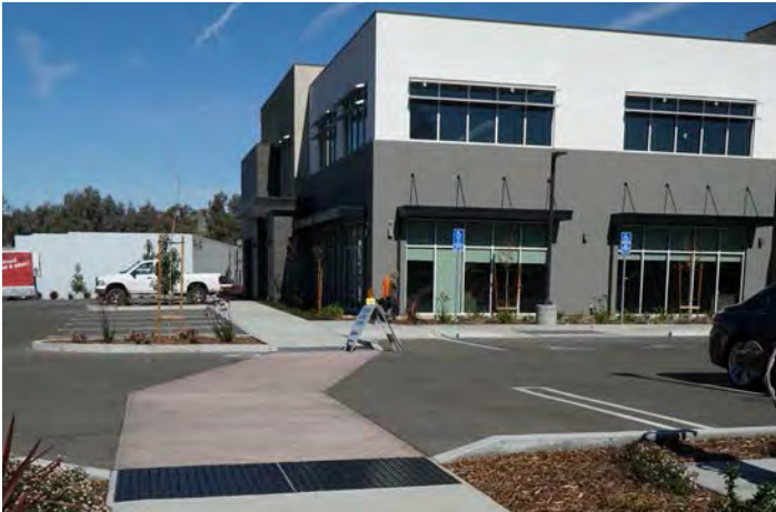
Unique, colored paving clearly identifies pedestrian pathway through parking area.