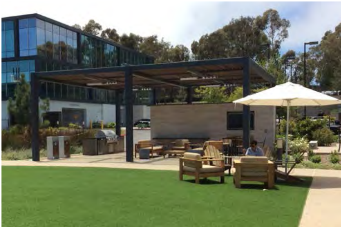
Outdoor employee area located to take advantage of sun access, while providing facilities such as barbecue, recreation areas, and outdoor patio.