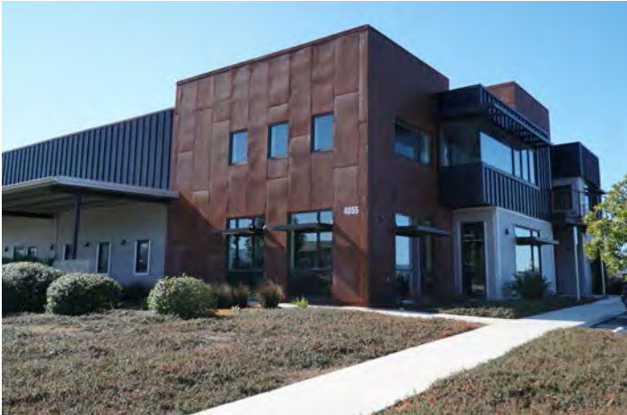
Pedestrian pathways are easily identifiable and connect the building to parking areas and off-site sidewalks.