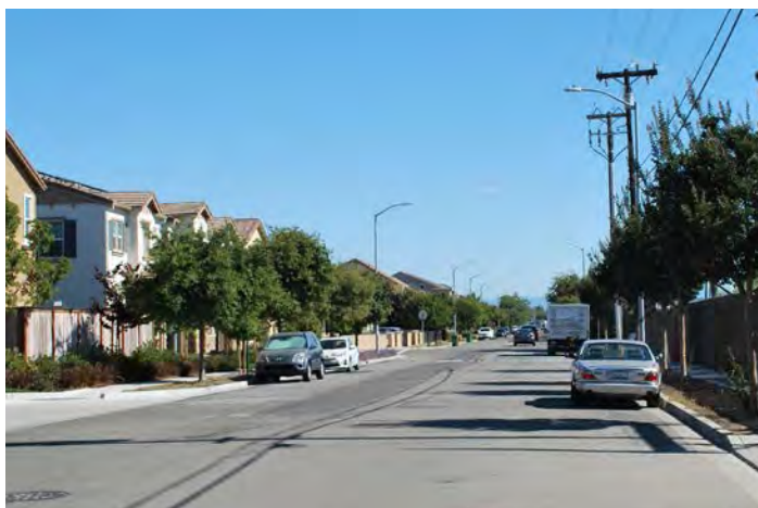
Residential streetscape character (left) is maintained by industrial properties (right) through consistent tree and shrub type and placement.