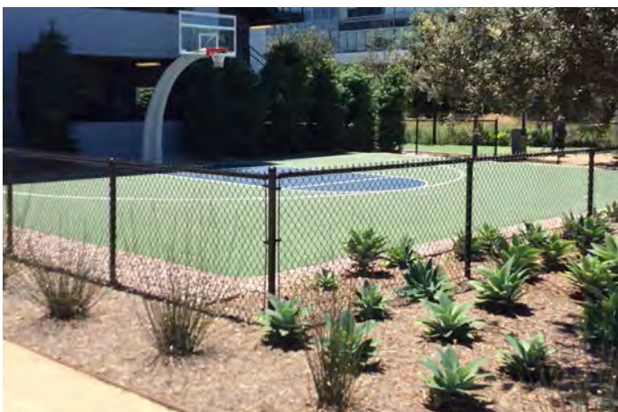
Half court basketball for games between employees on breaks.