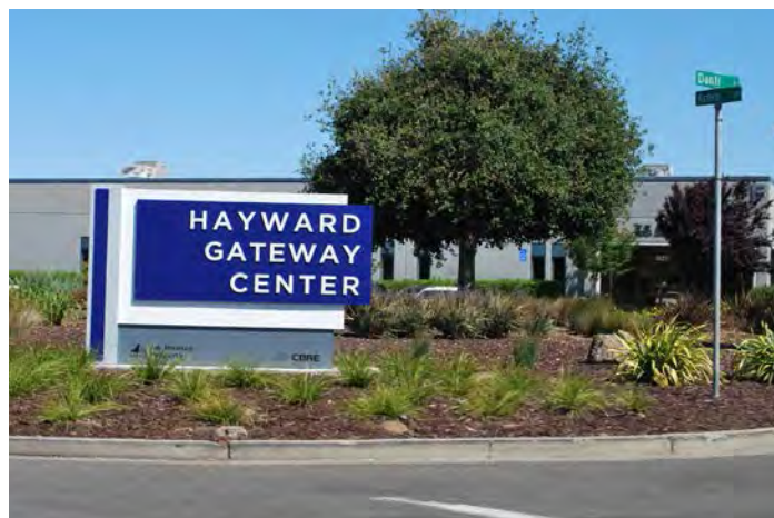
Project signage coordinated with overall colors and materials palette for the project.