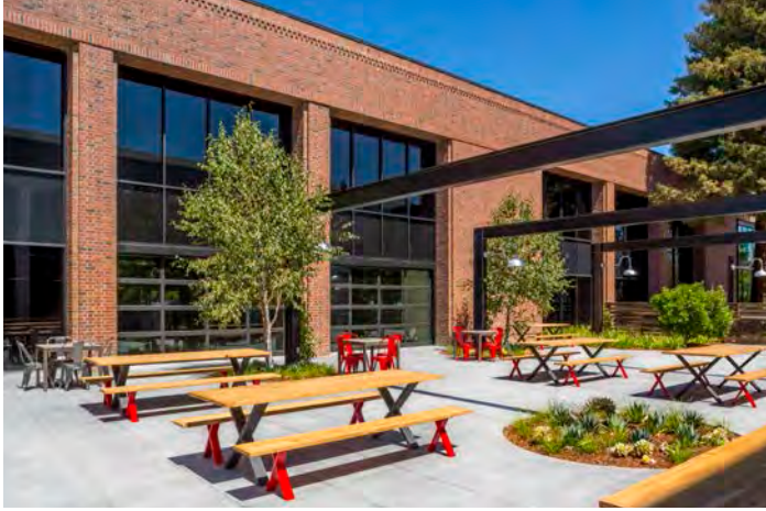
Outdoor eating area located adjacent to indoor break areas and enhanced through use of scored concrete.