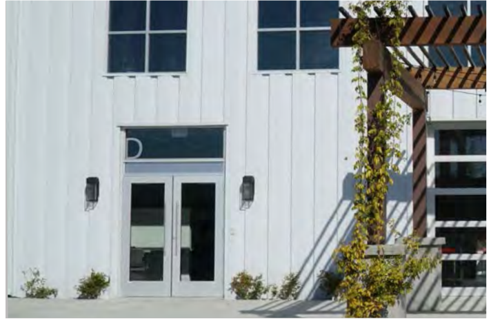
Light fixtures mounted at appropriate height for setting adjacent to building entry and shielded downward.