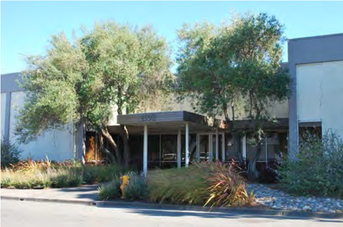
Accent landscaping utilized to create visual interest and highlight primary building entry.