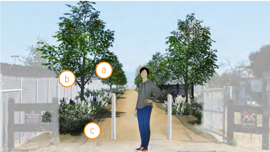
Example landscaping adjacent to open space, trails, or trail access.