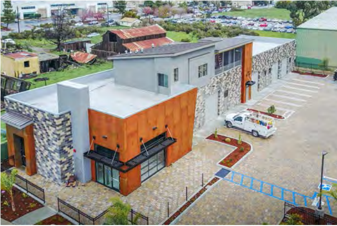
Unique paving at driveway highlights site entry while building is oriented to allow for daylighting of interior work areas.