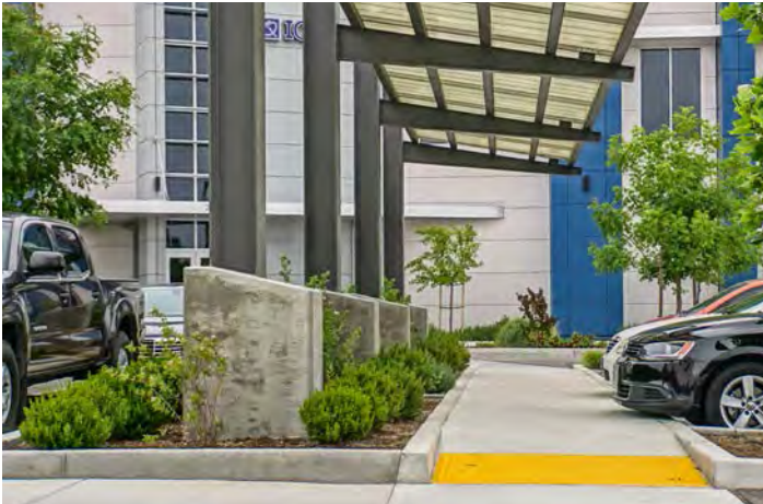
Landscaped islands provide clear pathways to primary building entry while minimizing pedestrian conflicts with vehicles.