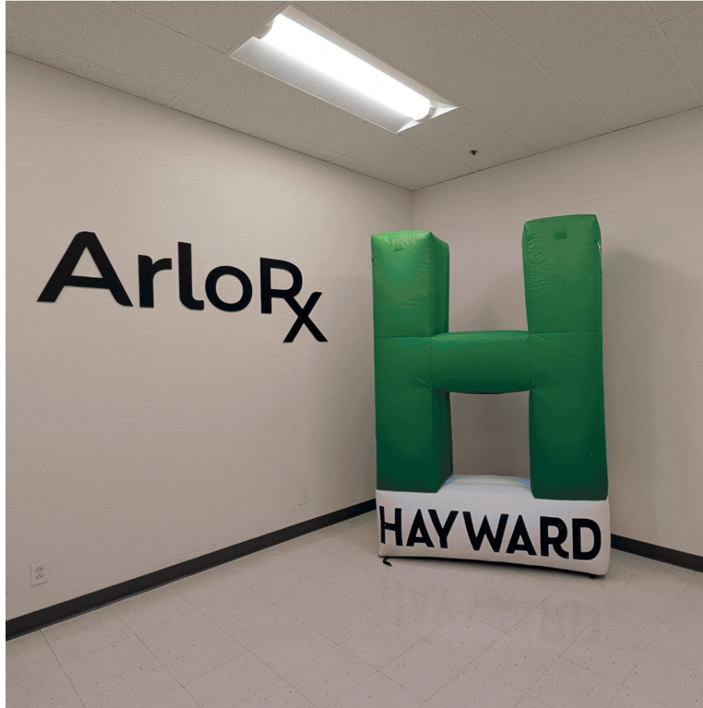
Arlo Rx 3157 Corporate Place