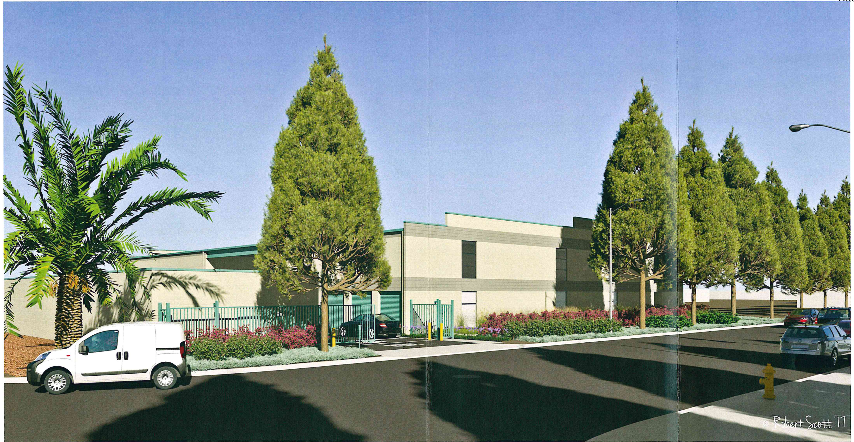
From Thunderbird Place looking Northwest