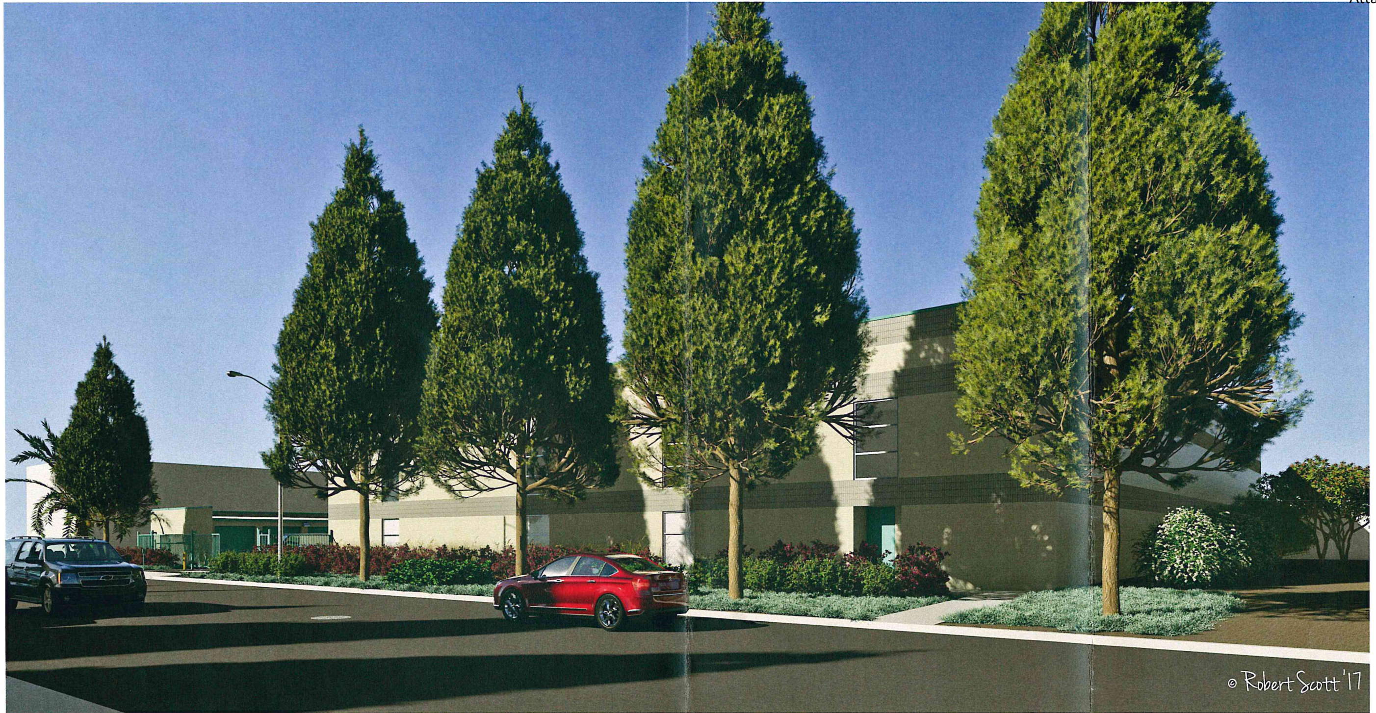
From Thunderbird Place looking Southwest