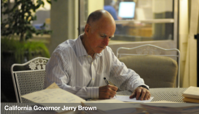
California Governor Jerry Brown