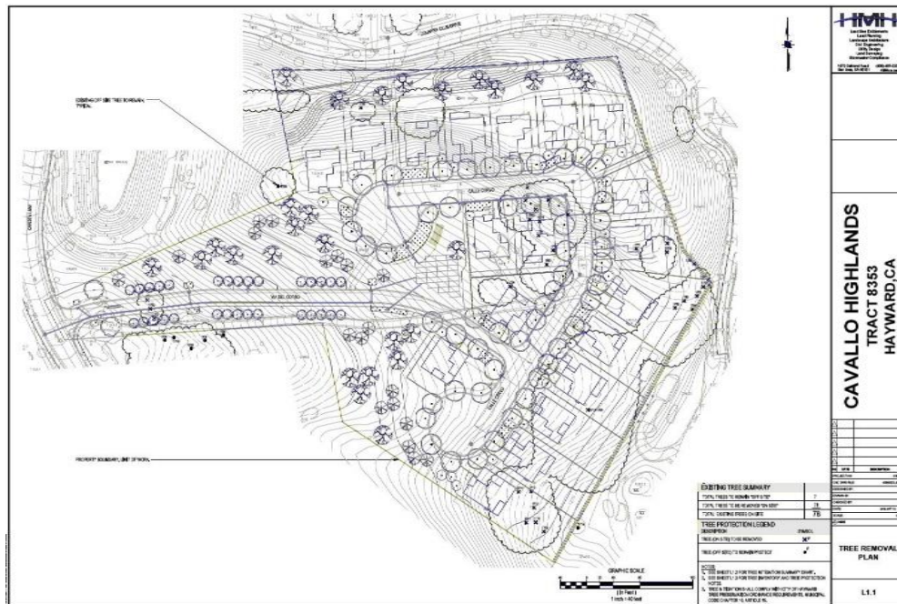
Figure 1 – PD Zoning Submittal Site Plan – December 2018

Through thoughtful planning, nineteen units have been designed to maximize the development area while minimizing impact to neighbors and neighboring uses.