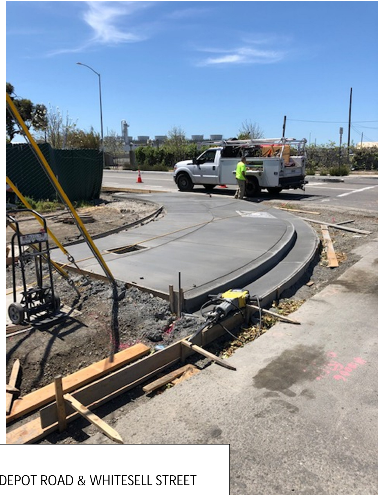
AFTER LOOKING AT THE SOUTHEAST CORNER OF DEPOT ROAD & WHITESELL STREET (UNFINISHED SECTION OF RELIEVER ROUTE PROJECT)