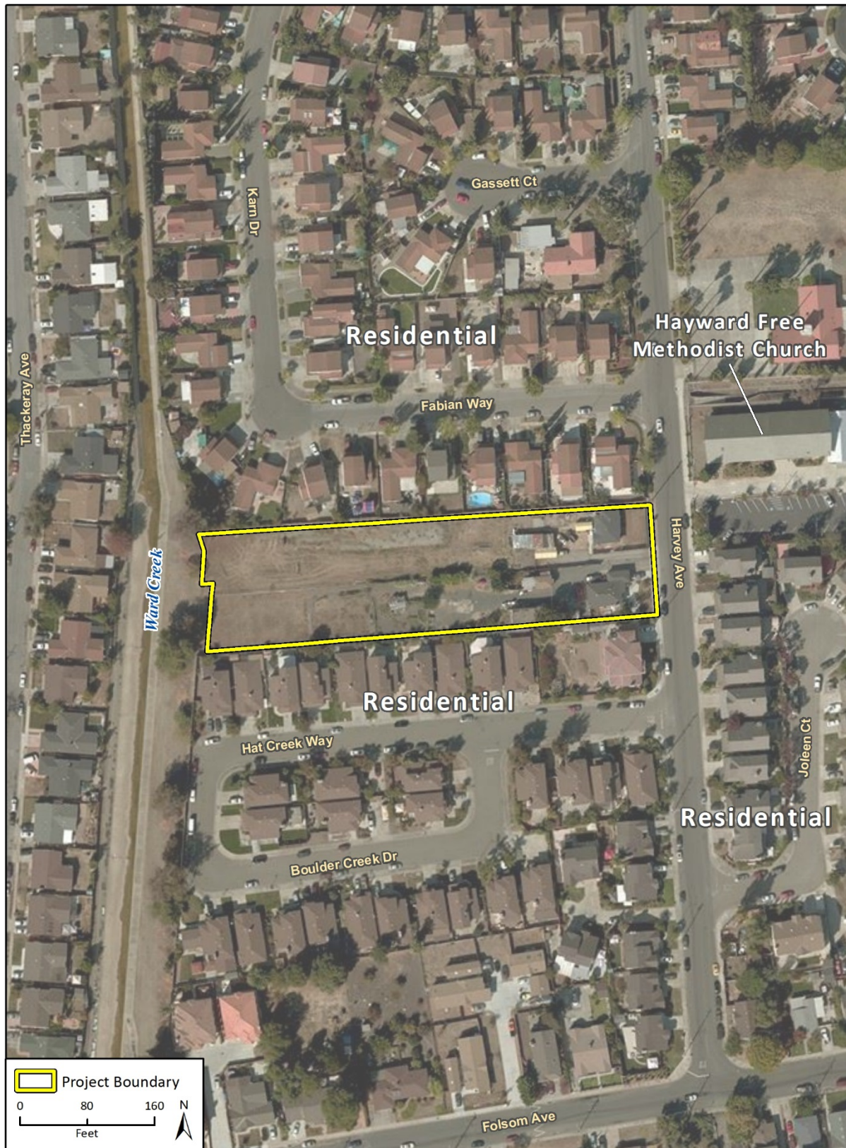
Figure 2 Project Site Location