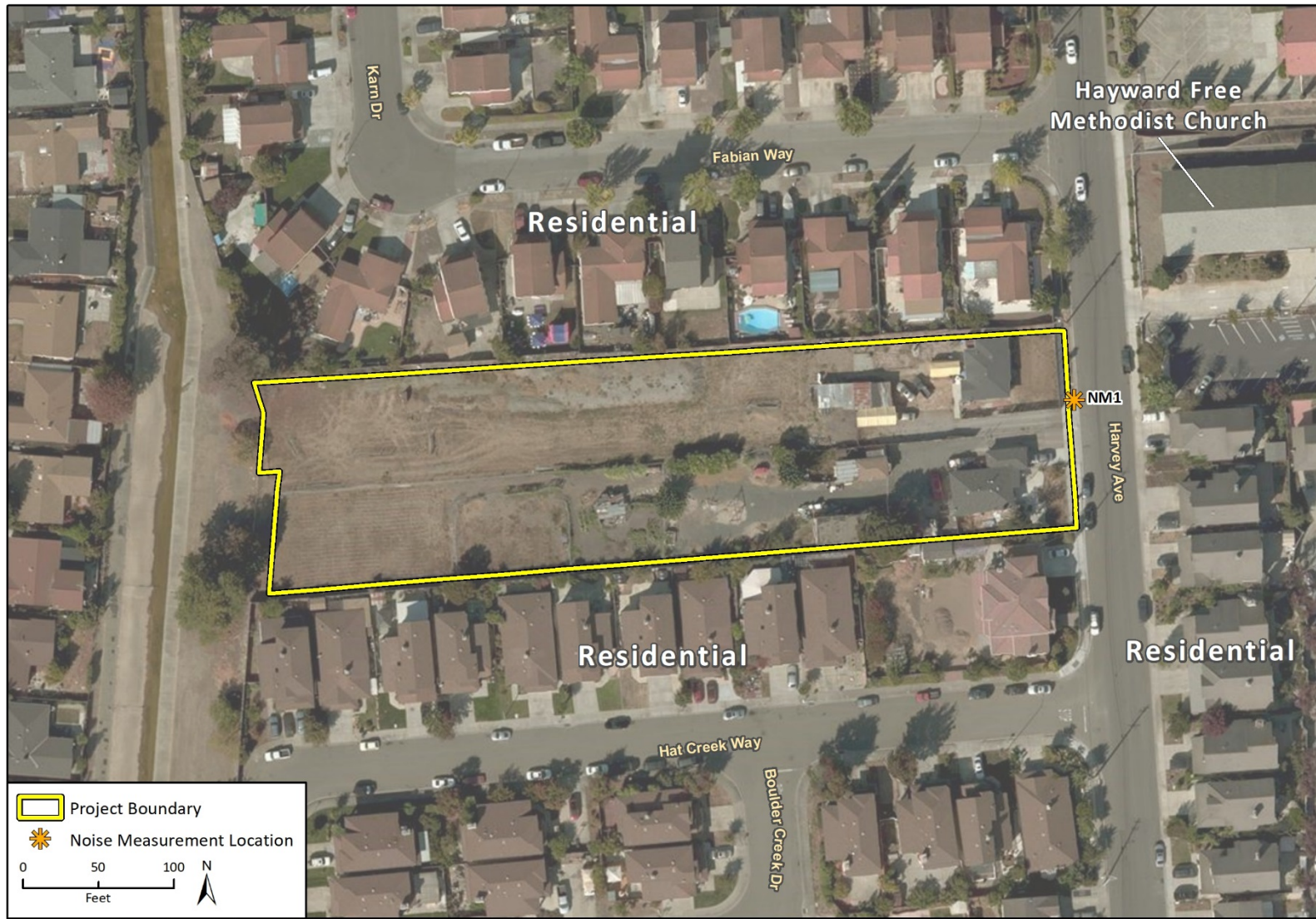
Figure 4 Noise Measurement Location

City of Hayward 28571 and 28591 Harvey Avenue Residential Project