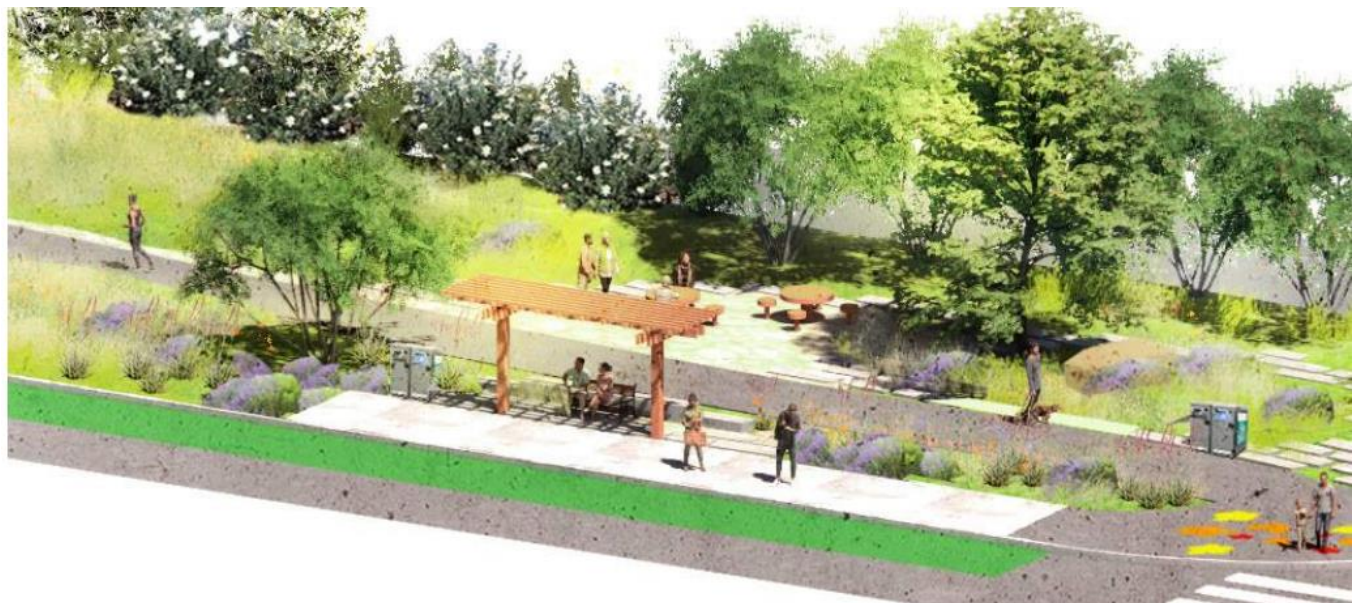
The addition of a shade trellis at the Corrine Street bus stop

With the completion of the construction documents, staff seeks the Council’s approval of the plans and specifications and call for bids to be received on December 14, 2021.