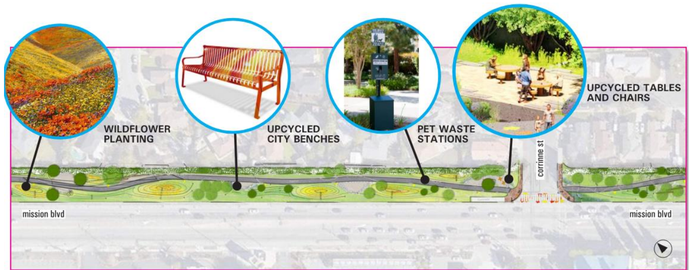
Other features include new planting, using upcycled material and pet waste stations