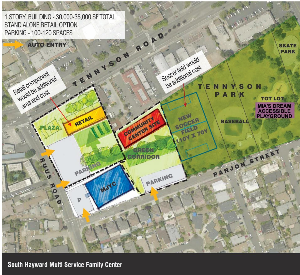
Figure C, above, shows a diagrammatic view of one option where a new facility potentially could be located in relation to the existing assets in the vicinity and with respect to the potential future development opportunities the site has to offer. The proposed South Hayward Family Center facility, labeled “Community Center Site” in the diagram, is shown as a single story, 35,000 square foot building near the Matt Jimenez Community Center on the western edge of Tennyson Park. The existing Matt Jimenez Community Center, which would be preserved, is labeled in the diagram as “MJYC.” To help show the scale and potential of the site, a proposed soccer field is shown where one could potentially be constructed in the park. Also shown at the right of the diagram for reference is the approximate proposed location of the Mia’s Dream Park, a universally accessible children’s playground which is being funded separately by the HARD Foundation and private funds, and is not considered part of the South Hayward Family Center construction project budget. At the top left of the diagram on the prime corner of Tennyson Road and Russ Road is shown one of many possible configurations of potential retail development that could be pursued to activate that prominent corner and