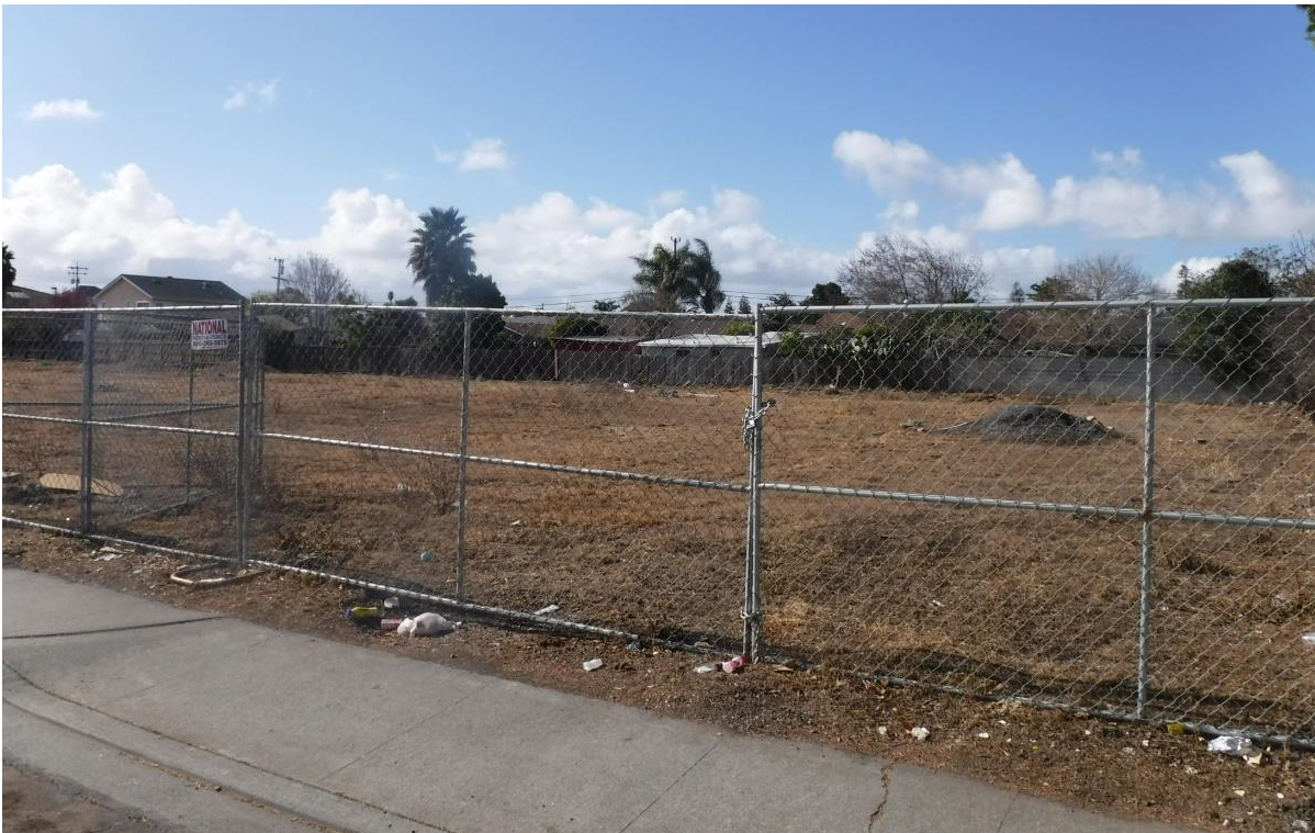
Photograph 2: View of the project site looking west from Manon Avenue.