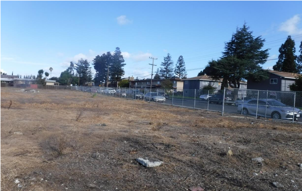
Photograph 1: View of project site from the southern boundary of the site facing north towards Manon Avenue.