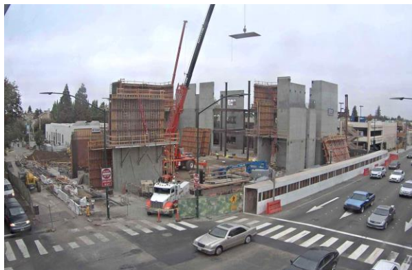
Photo of construction progress, Sept 16, 2016

Library Construction Update. The construction has been progressing nicely. The reinforced concrete foundation and supporting walls are nearly complete, and the steel framing work has begun. A “topping ceremony” is planned in early November, during which the final piece of steel will be ceremonially signed by guests before being installed at the top of the building. Watch a live 24/7 webcam of construction at www.haywardlibrary.org/webcam