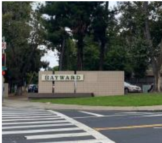
Figure 1: Existing Monument

This project is categorically exempt from environmental review under Section 15302 of the California Environmental Quality Act (CEQA) Guidelines for the replacement or reconstruction of an existing structure with the same size, purpose, and capacity. Likewise, because the construction cost estimate is less than $1,000,000, the Community Workforce Agreement (CWA) with the Alameda County Building Trades Council (BTC), does not apply to this project.