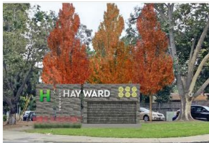
Figure 2: Proposed Monument