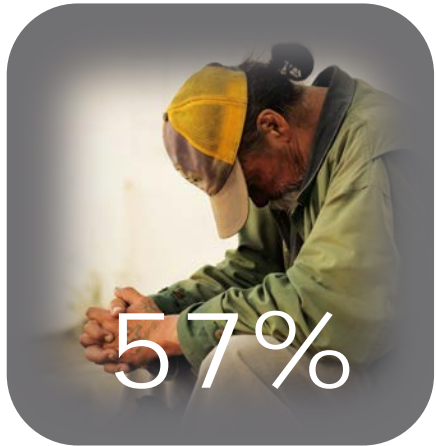
HOUSING AND HOMELESSNESS