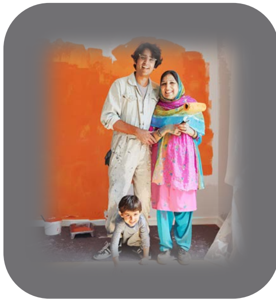
Infrastructure & Economic Development (CDBG)