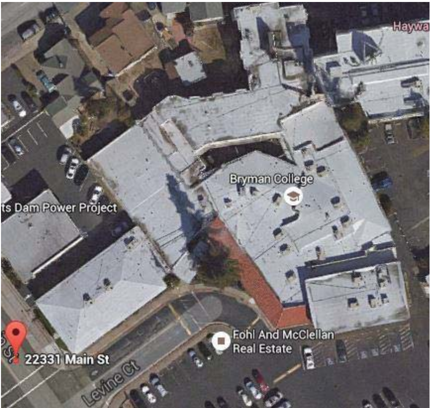
Figure 1 Aerial View of 22330 Main Street, Hayward

The most recent version of the GreenPoint Rated checklist is provided in Appendix A. The CalGreen standards are provided in Appendix B. Lastly, the Bay Friendly Landscapes standard is described in Appendix C.