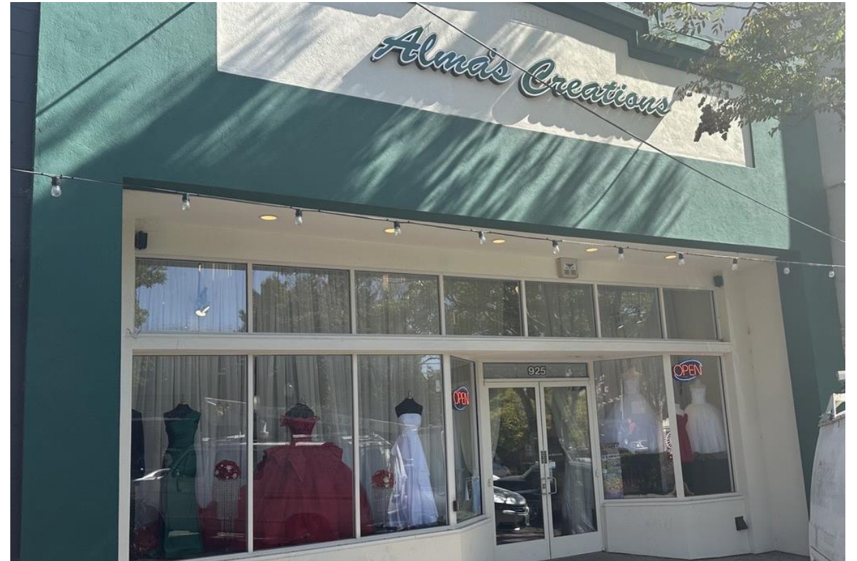
Alma's Creations 925 B St.