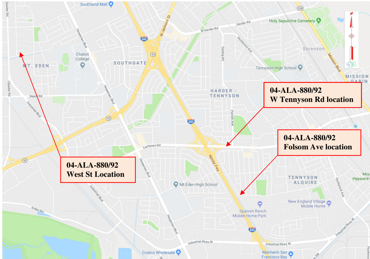
City of Hayward, Alameda County