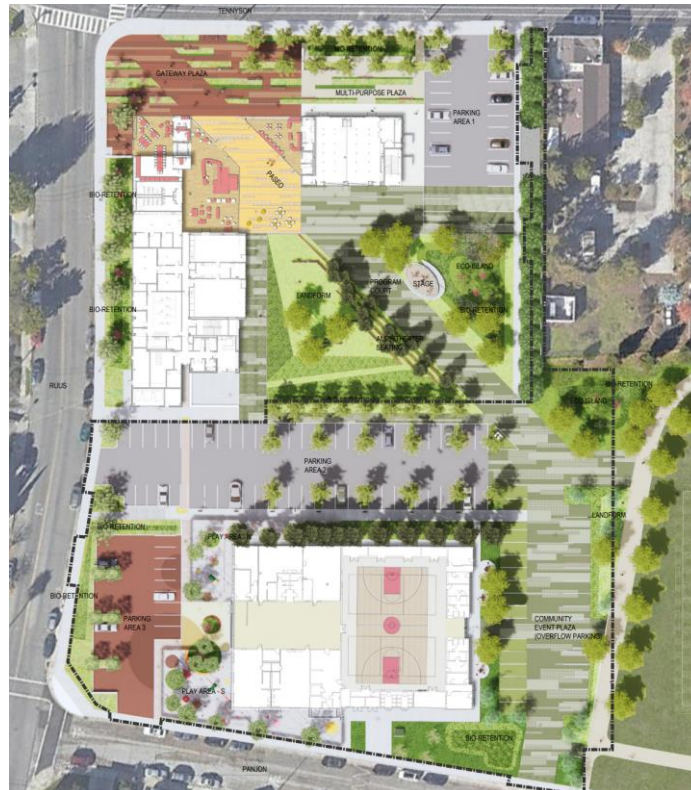
Phase I boundaries in the dotted line (see Attachment IV for larger image)