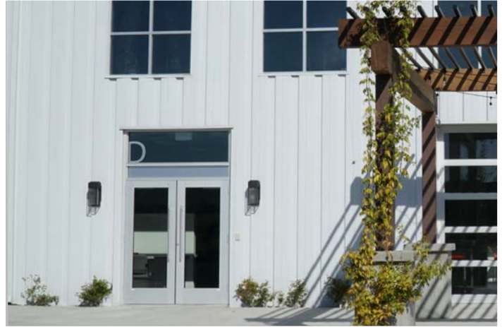
Light fixtures mounted at appropriate height for setting adjacent to building entry and shielded downward.