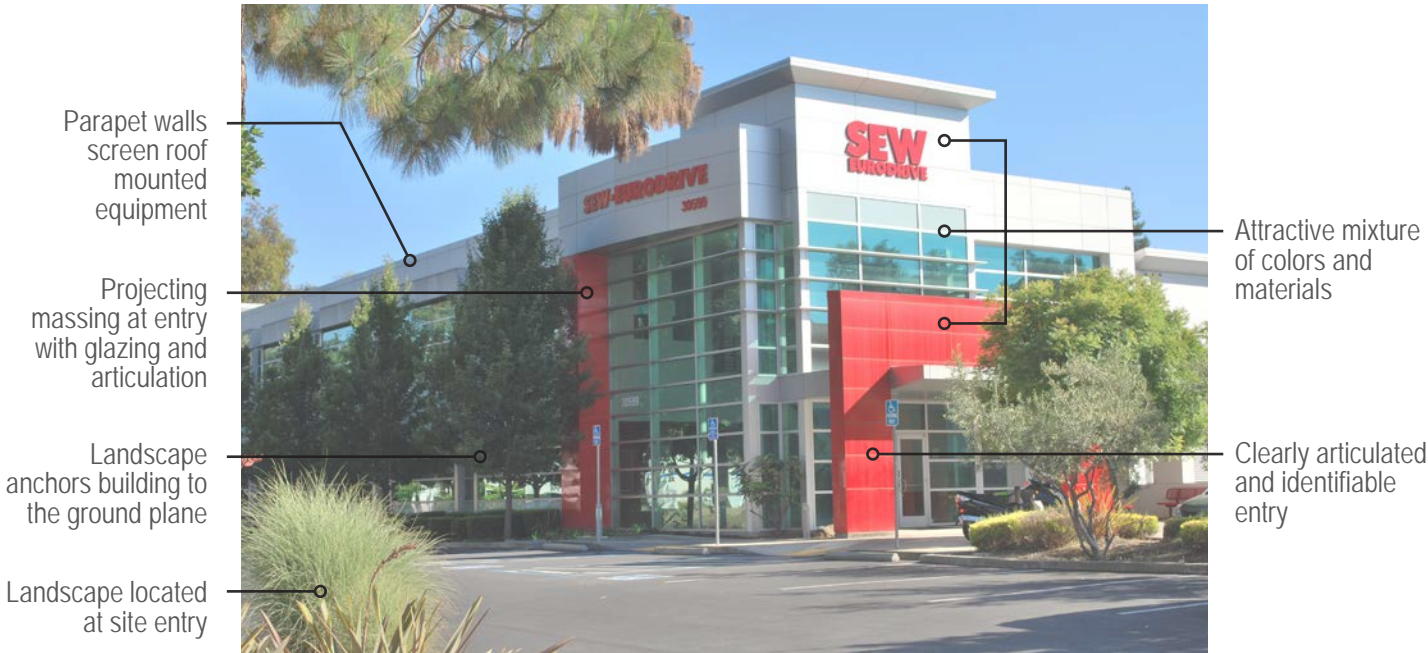
Example of recent industrial development reflecting current design characteristics.

Development in the Industrial District is intended to be characterized by functional, well designed site and building development to improve the economic viability of properties and to enhance the visual character of the Industrial Technology and Innovation Corridor. Important features of development include coordinated landscaping along frontages and adjacent to open spaces, safe and clearly demarcated pedestrian connections, prominent entries with articulation and detailing, loading docks at the side or in the rear, and amenities such as recreational facilities, open space, benches, shelter and other features that enhance the employee experience.