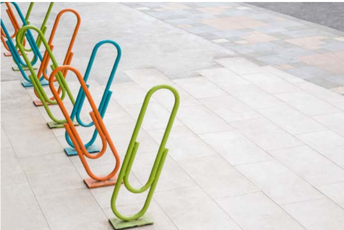
Bicycle rack placed near primary building entry as unique feature that complements adjacent business.