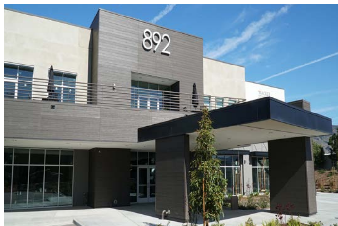
Primary business signage located prominently above building entry to enhance visibility from the street.