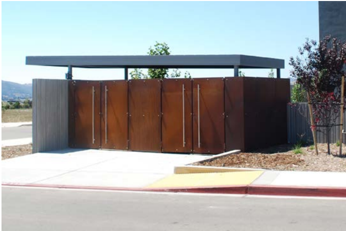
Trash enclosure providing pedestrian entries enhances ease of use.