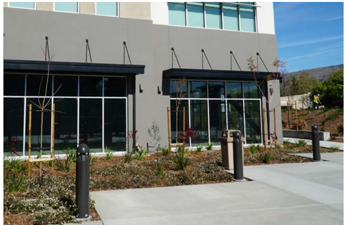
Low, bollard light fixtures placed to provide lighting within pedestrian areas.