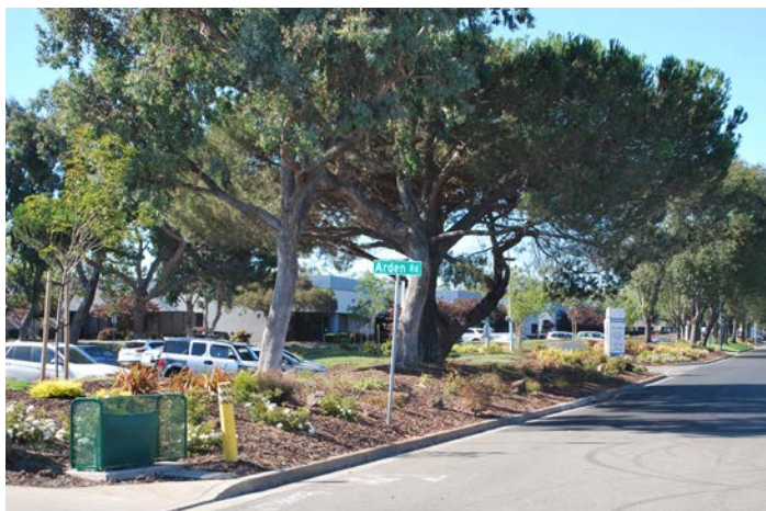
Uniform landscape palette establishes streetscape character and complements adjacent property landscaping along the street.