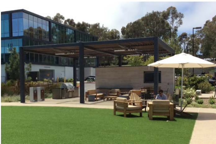
Outdoor employee area located to take advantage of sun access, while providing facilities such as barbecue, recreation areas, and outdoor patio.