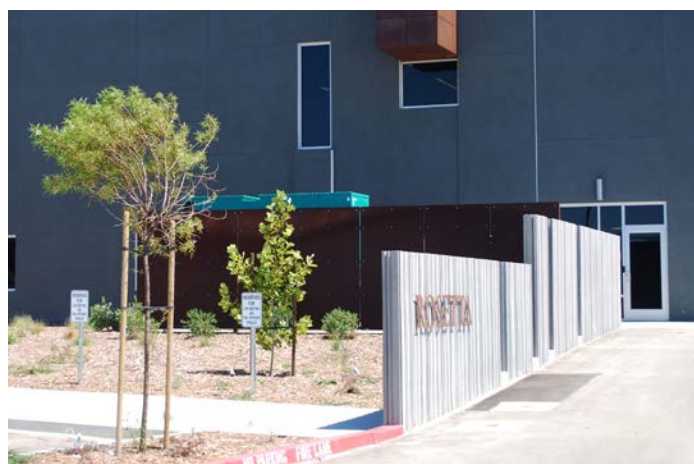
Wall and fencing designed as integral part of a site through continuation of building materials, with landscape minimizing visual monotony.

10. Design fencing as an integrated part of the site, rather than as a separate fence (i.e. planter wall, continuation of architectural wall), and ensure fencing design and material selection is as part of the overall development.