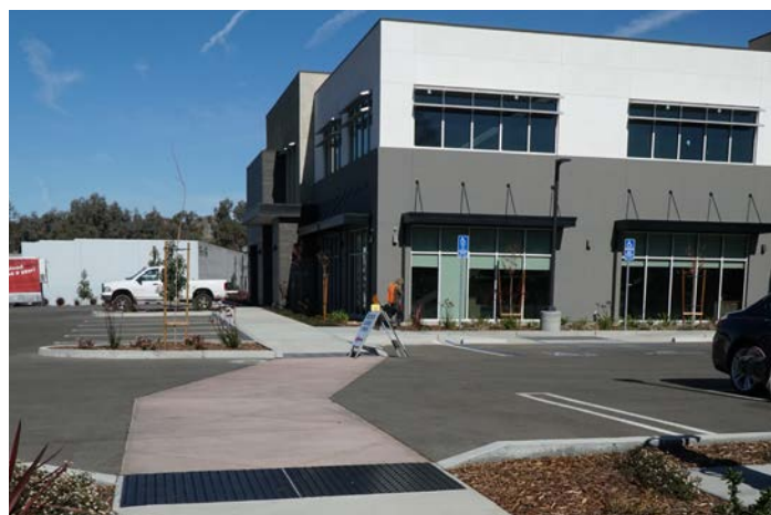
Unique, colored paving clearly identifies pedestrian pathway through parking area.