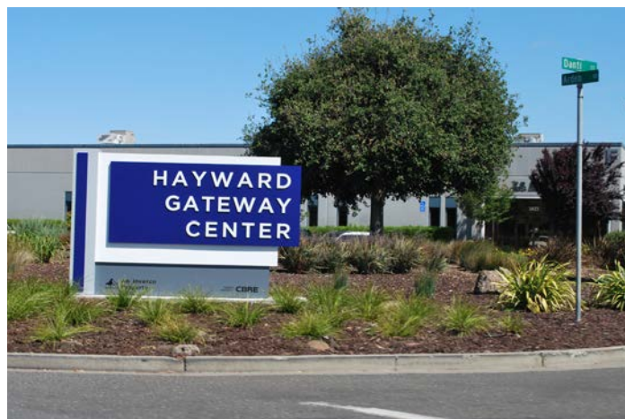
Project signage coordinated with overall colors and materials palette for the project.