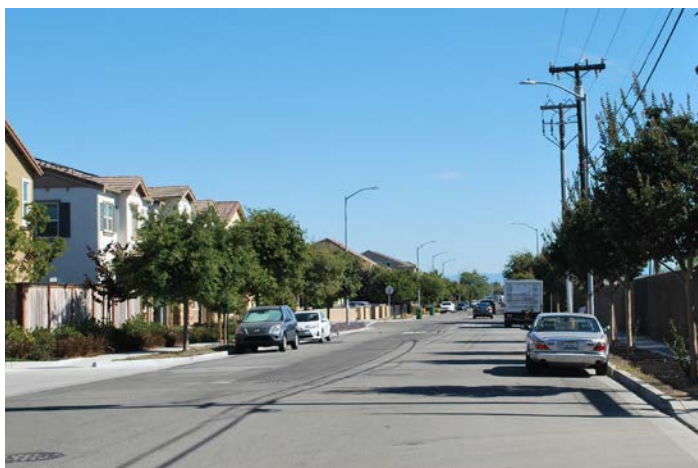
Residential streetscape character (left) is maintained by industrial properties (right) through consistent tree and shrub type and placement.