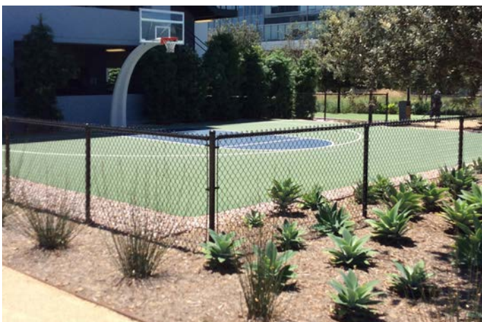
Half court basketball for games between employees on breaks.