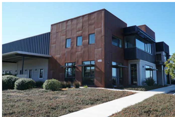
Pedestrian pathways are easily identifiable and connect the building to parking areas and off-site sidewalks.