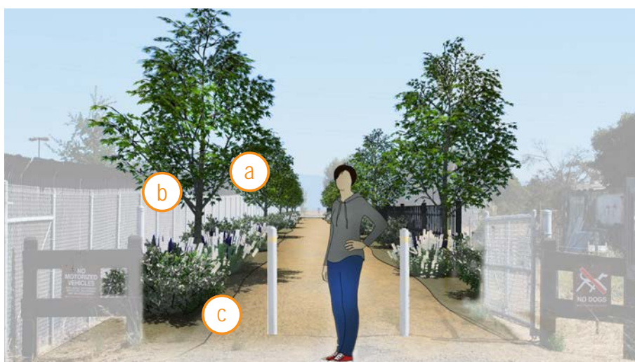
Example landscaping adjacent to open space, trails, or trail access.

c Low shrubs maintain sense of openness and visibility to enhance safety.