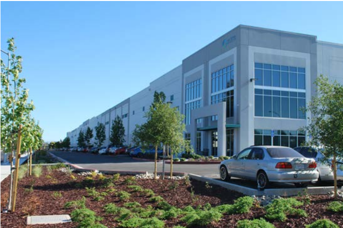
Street facing building elevation includes variation in wall plane, wall height, and roofs at different levels.