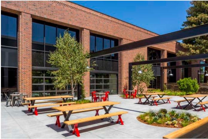
Outdoor eating area located adjacent to indoor break areas and enhanced through use of scored concrete.