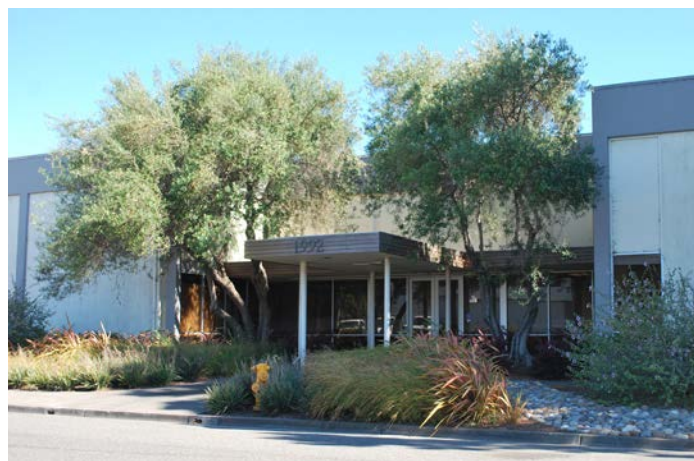
Accent landscaping utilized to create visual interest and highlight primary building entry.

7. Utilize accent landscaping to distinguish driveway entries, primary building entrances, employee amenity areas, trail access points, and other activity areas of a site.