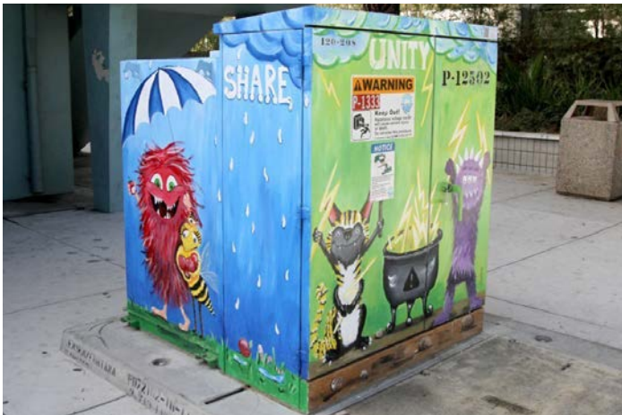
Utility equipment unable to be screened has been enhanced through an art mural.