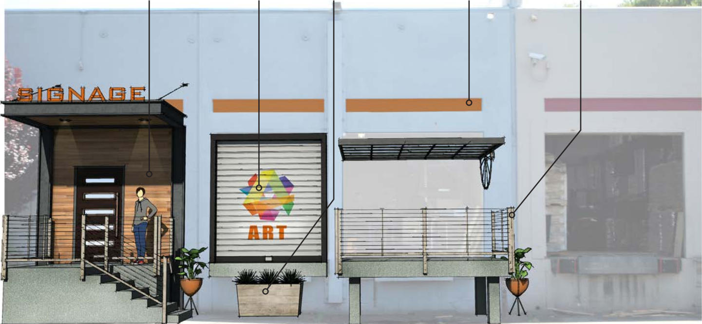
Street facing facade improvements that could occur to create and enhance visual interest.