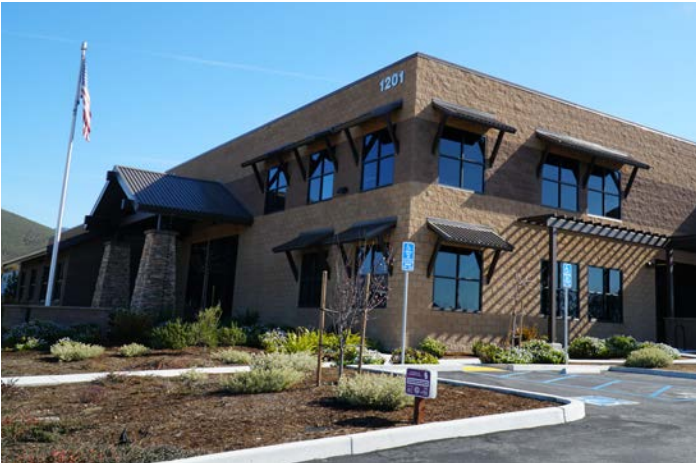
Articulation and detailing continue on side elevation through use of windows, awnings, and other detailing.