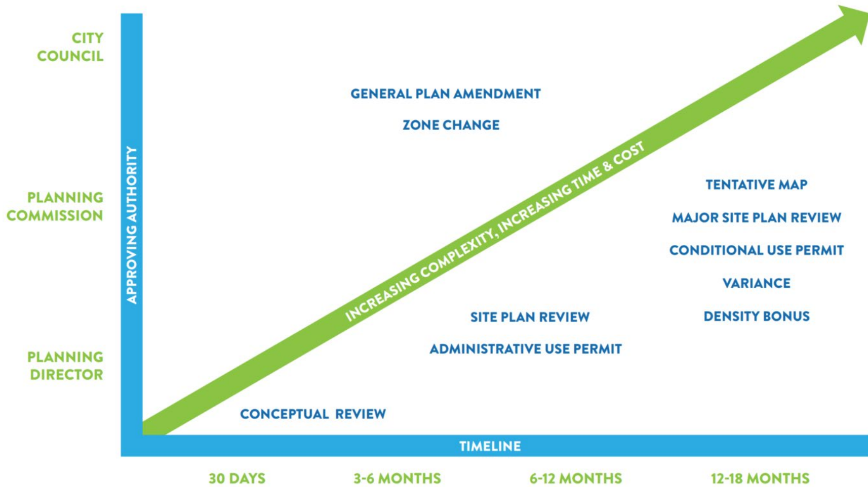
Figure D-3 Development Process and Approval Timelines