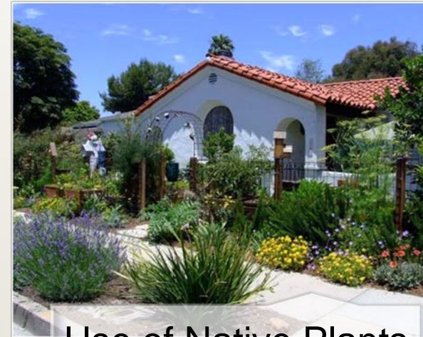
Use of Native Plants & Landscaping