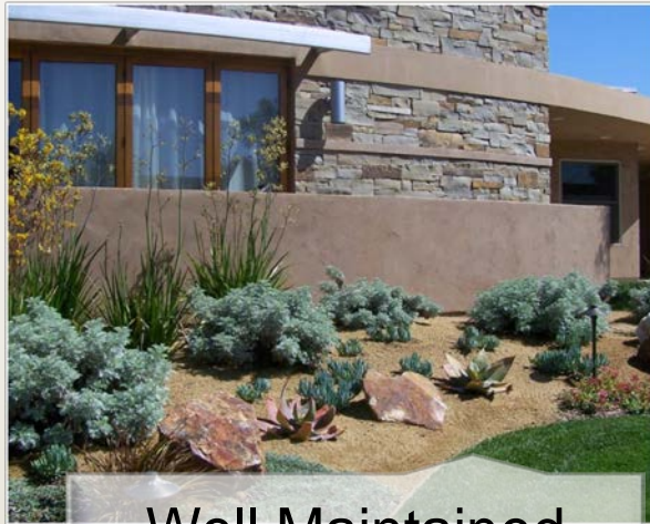
Well Maintained Foliage