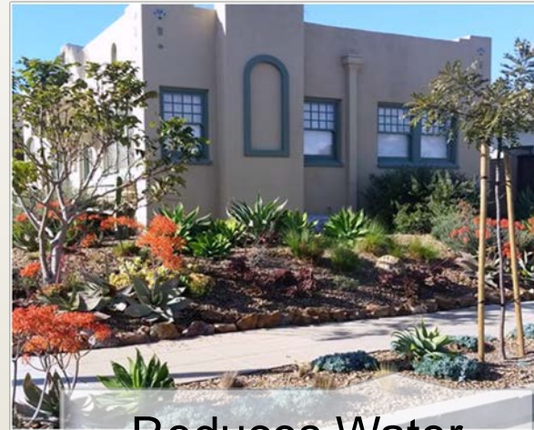
Reduces Water Usage