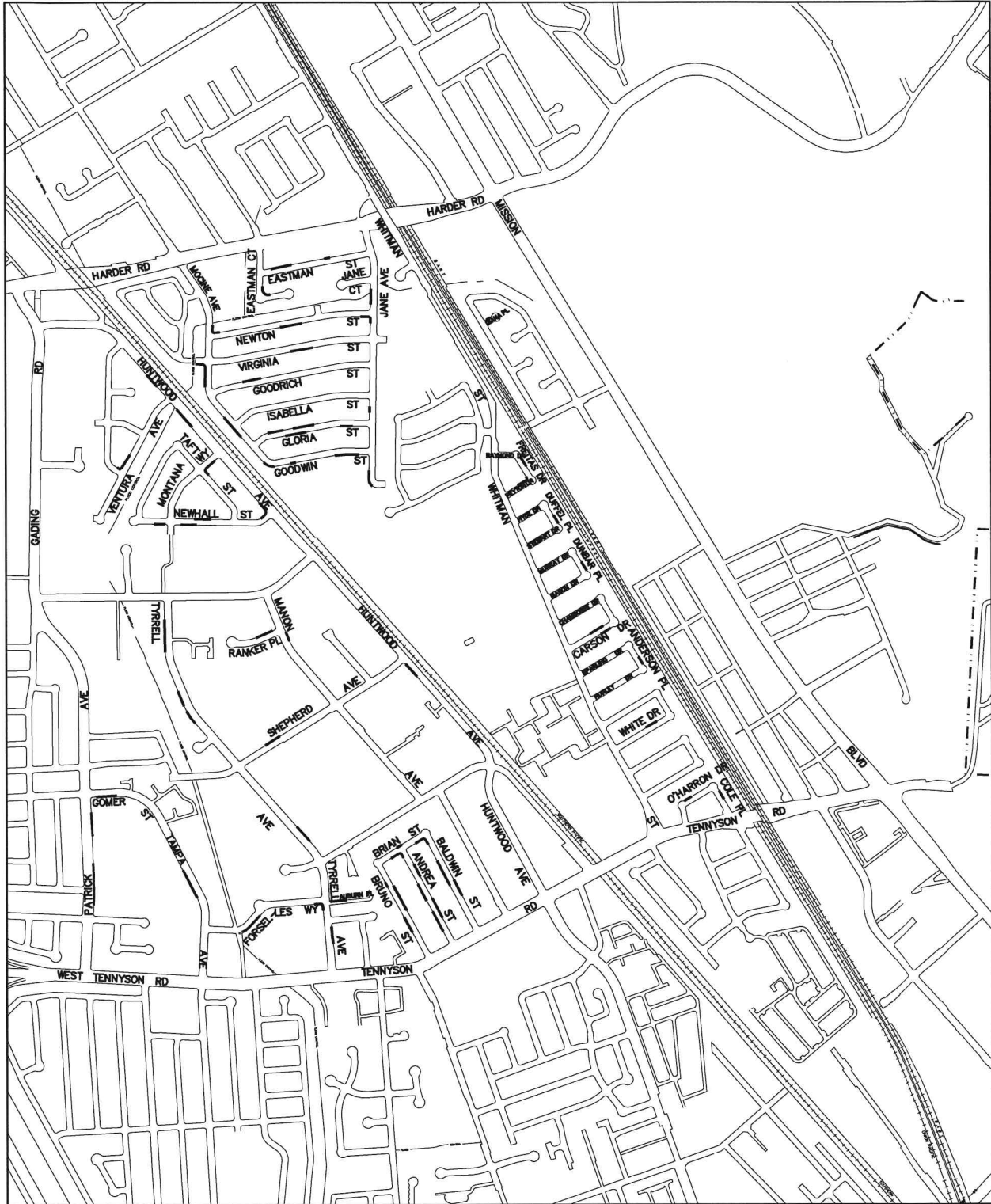
LOCATION MAP SIDEWALK REHABILITATION FY16 DISTRICT 3 - PROJECT NO. 05256