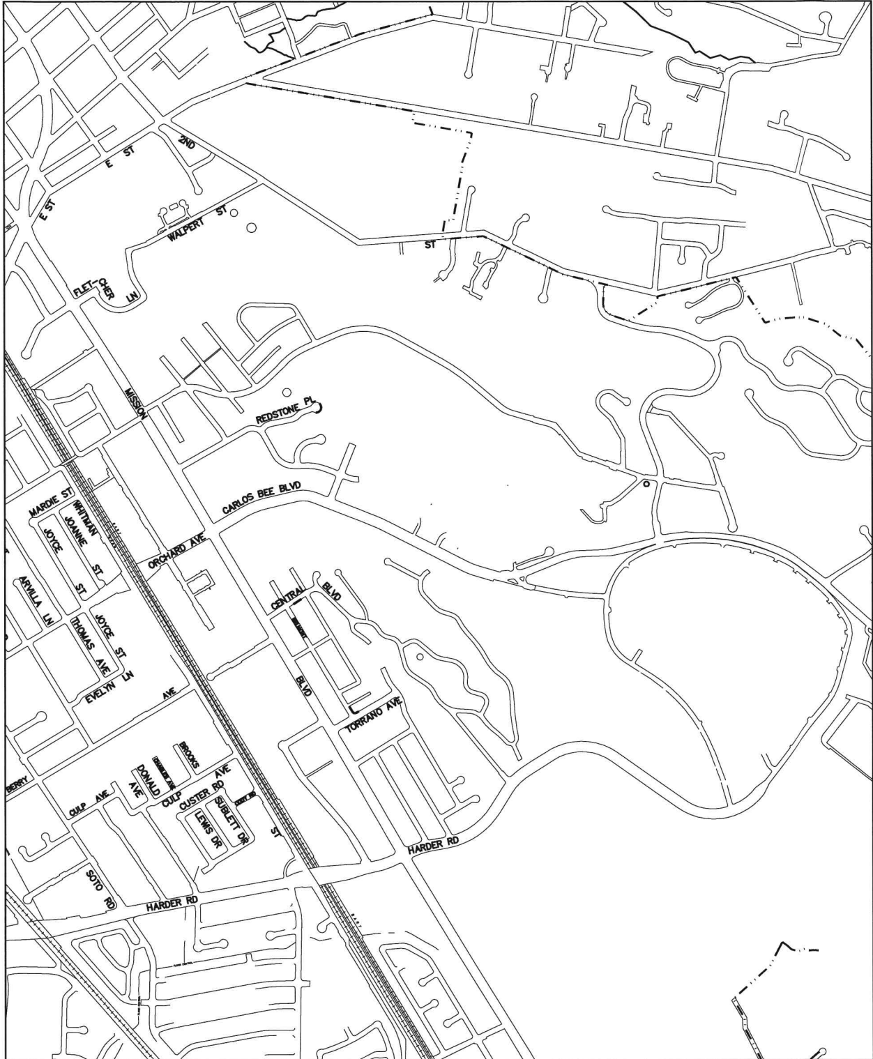
LOCATION MAP SIDEWALK HABILITATION FY16 DISTRICT 2 - PROJECT NO. 05256