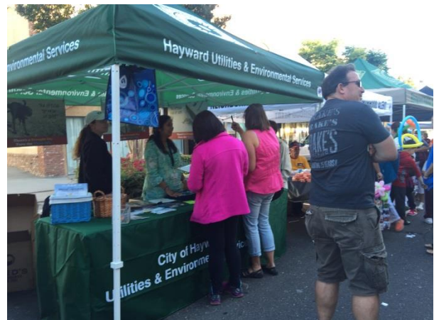
Staff at a Summer Street Party

Staff tables at several events a year to provide educational material and information about City programs to Hayward community members. In addition, staff provides KHC&G with information to distribute at their monthly cleanups. Attachment III is a calendar including these and other possible events.