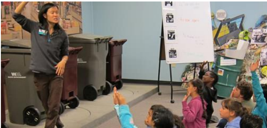
Waste Management's irecycle@school tour