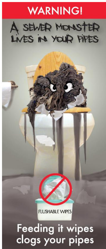
Water bill inserts