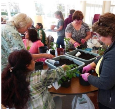
Water Efficient Landscaping Class