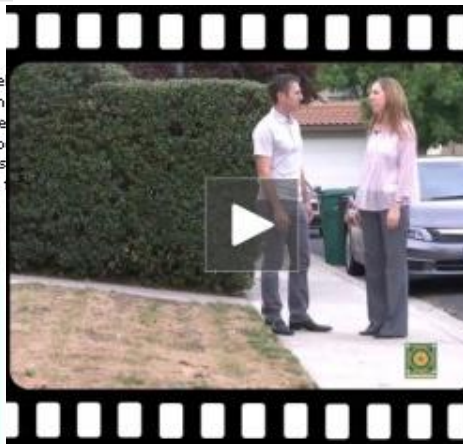
Drought Watch Video