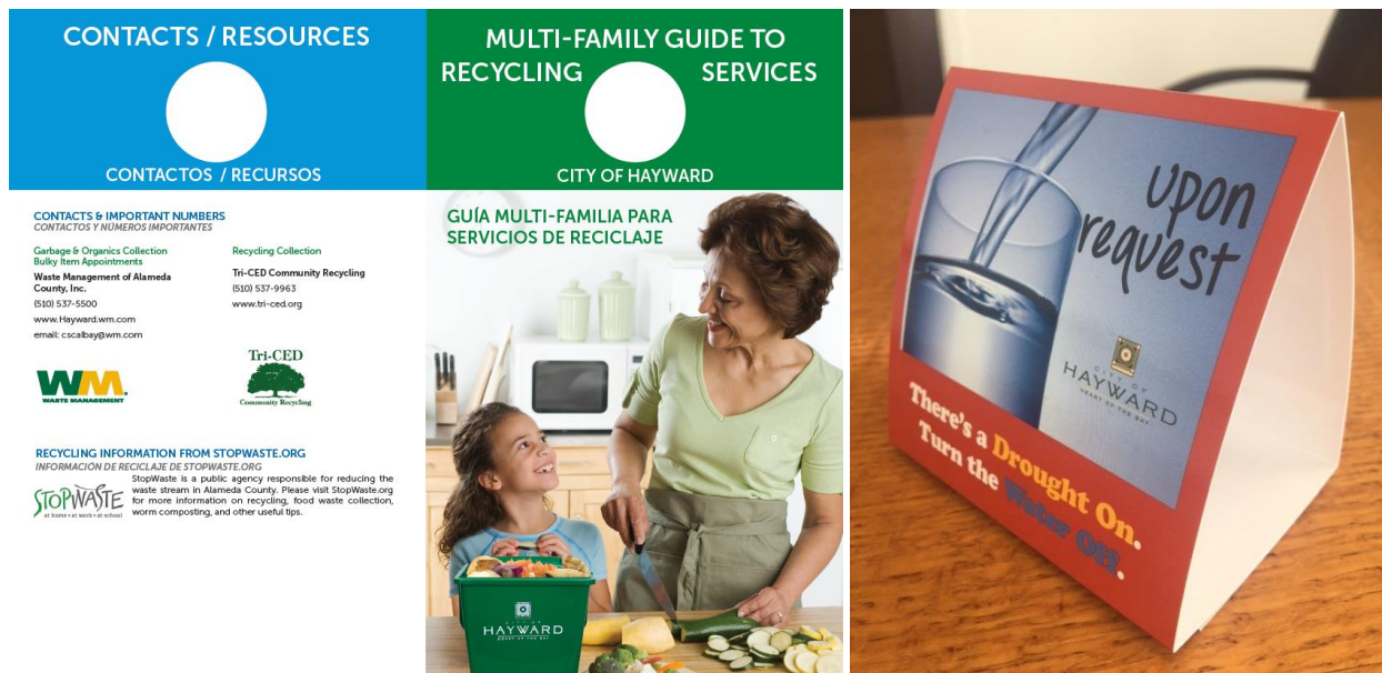
Door hanger that the City provides to multifamily complexes