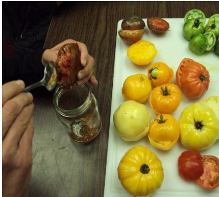
Seed Saving Workshop