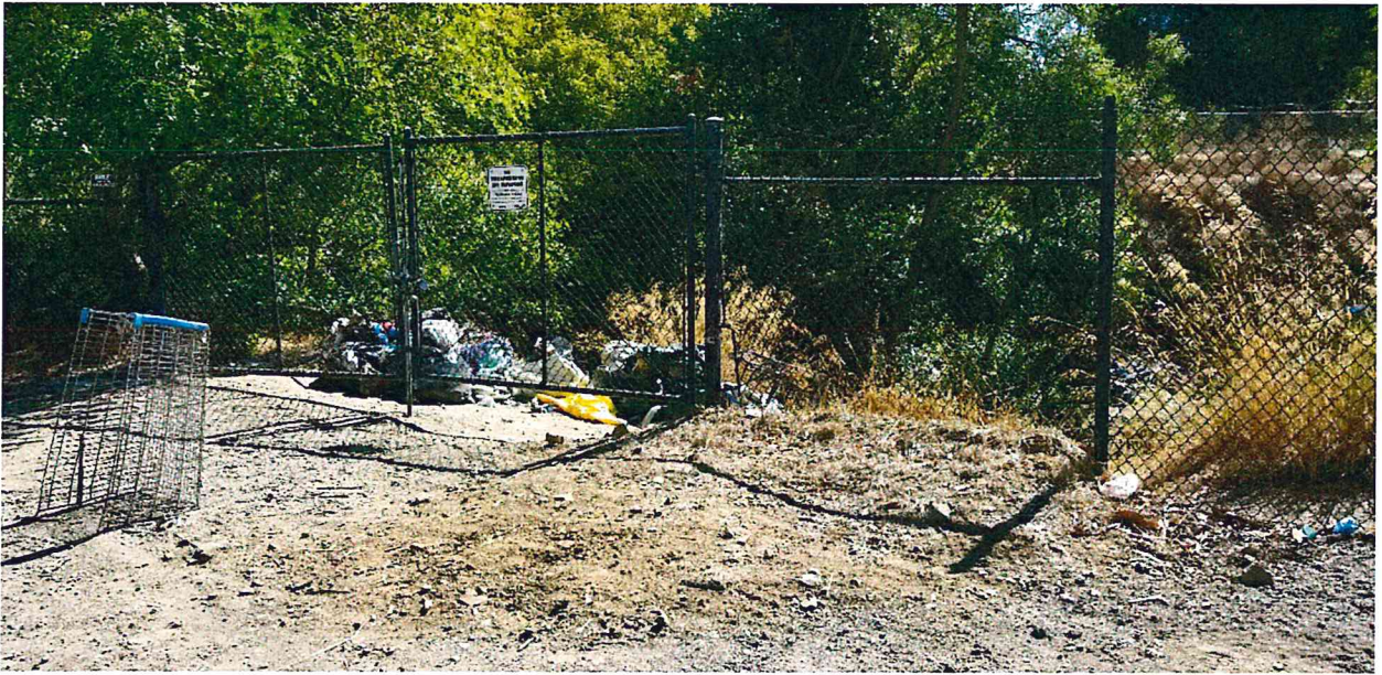
View from A Street