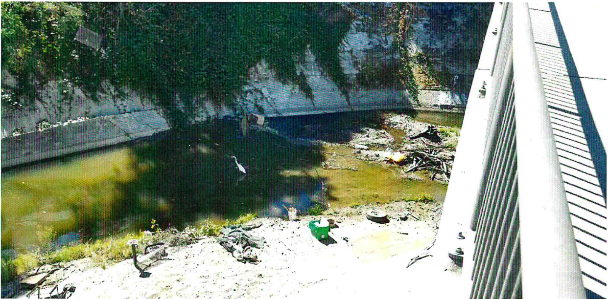
Top: Where the evening prior I observed 8 men and women entering and exiting the creek through the break in the fence.