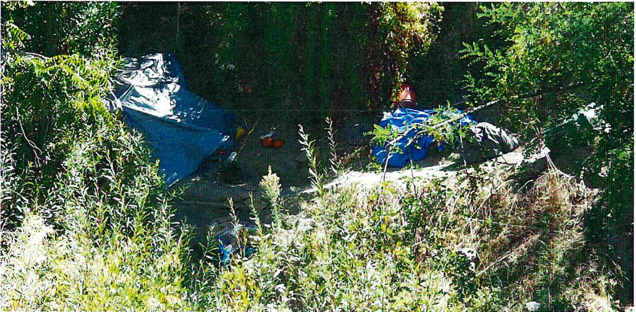
Top: The big picture in the creek