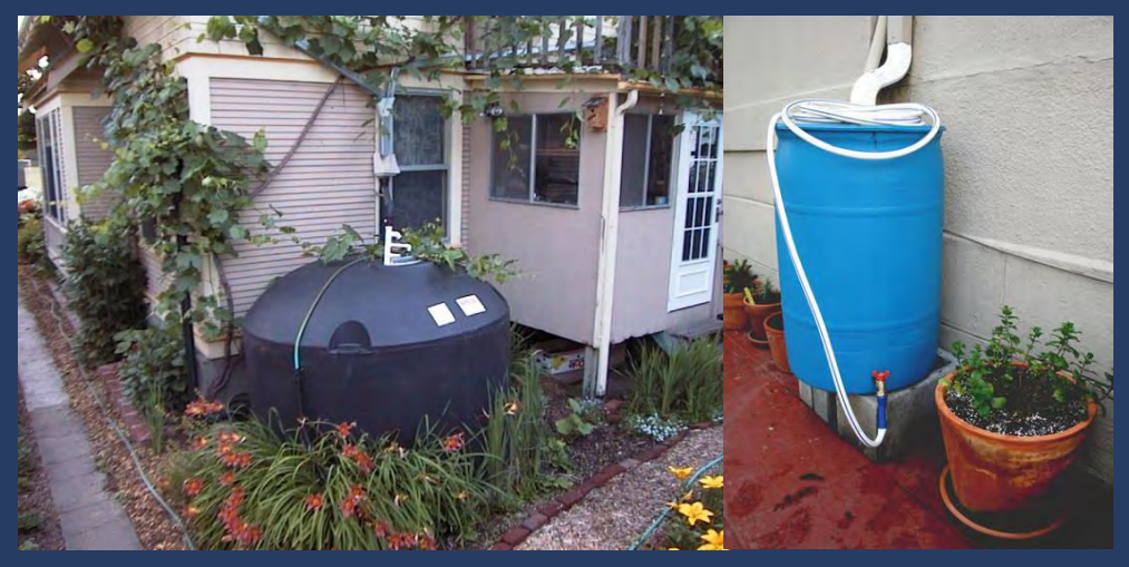
Rainwater Harvesting (approximately 250 and 50-gallon barrels)