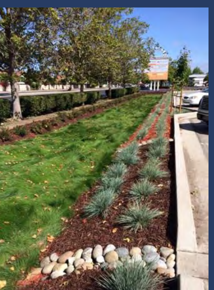
All images in the report are located in City of Hayward.