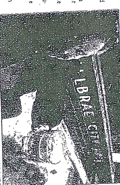
Winn Parker of Milibrae is campaigning against the use of chloramine in Bay Area water supplies.

water can enter the digestion and blood stream in another elimination. Anmonia, derived Nitrogen balance refers to the mainly from breakdown of in urine, sweat and bowel intake and total nitrogen loss difference between nitrogen form called a nitrogen balance glutamine for transport to the nia by converting it to animals. Human Ussues, thereamino acids, is toxic to all Chlolramine in drinking balance of the body. If the tron ammonia upsets the pH fore, initially detoxify ammoliver is functioning properly. liver. Collateral health damage