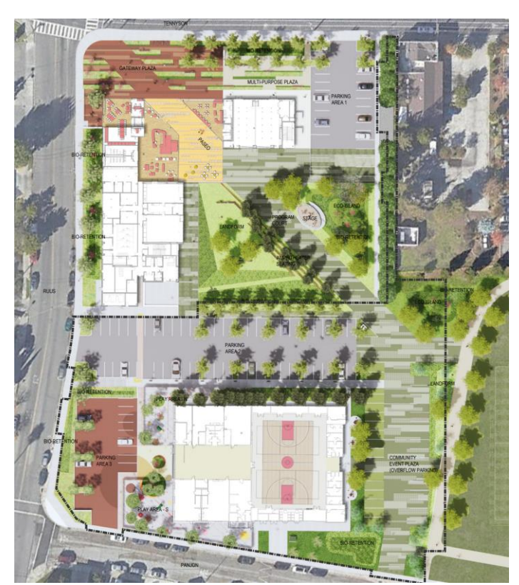
Phase I boundaries in the dotted line (see Attachment IV for larger image)