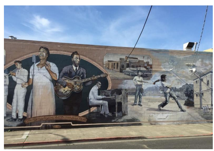
Figure 2: A Mural Maple Ct @ A Street

The City's Mural Art Program was established in 2009 to address the issue of escalating graffiti and vandalism in support of the Council's Safe, Clean and Green community priorities. The idea behind the program was to deter graffiti by installing beautiful mural artwork throughout the City on commercial buildings, schools, utility boxes, and overpasses. So far, more than 1,200 volunteers (including public schools, senior citizens, and community organizations) have participated in selecting and installing over 200 art installations throughout the City, including murals and tile mosaics.