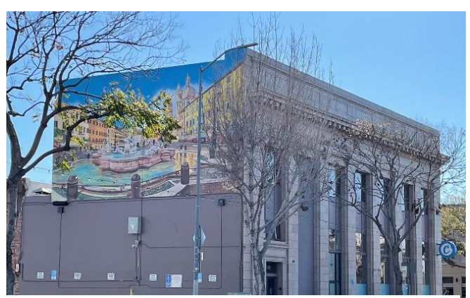
Figure 4: The mural on the back of the dispensary located at B and Main Streets.

When the City's cannabis regulations were first adopted, the Council imposed a requirement for developers of cannabis operations to incorporate public benefits into their proposed projects. Current regulations require that a portion of cannabis-related tax revenues are put toward community benefits rather than requiring developers to propose community benefits for their projects. However, under the initial regulations, the first cannabis dispensary approved by Council incorporated a mural on the back wall of the building located at the