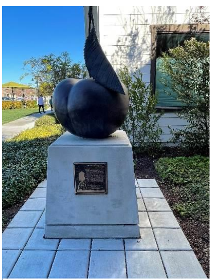
Figure 3 : A statue in the Cannery development.

Residential developments occasionally request that their property be rezoned to a Planned Development (PD) to be afforded more flexible development standards such as reduced setbacks or others. One of the PD rezone findings require that "any latitude or exception(s) to development regulations or policies is adequately offset or compensated for by providing functional facilities or amenities not otherwise required or exceeding other required development standards." Art is one amenity that can help developers meet this standard. In this instance, the developer of a tract in the Cannery area incorporated public art via a statue of fruit in homage to the area that had historically been part of the Hunts Fruit Cannery. (Figure 3)