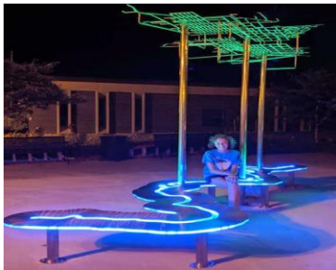
Figure 4. Solar sculpture in downtown Webster City in Iowa. The public art piece incorporates dynamic elements powered by solar energy. The sculpture was designed to reflect Webster's City's history and identity.