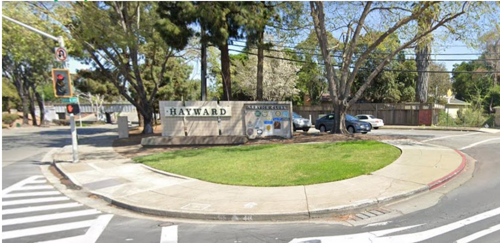
Figure 1. Existing Hayward Gateway sign on Jackson St. and Silva Ave.