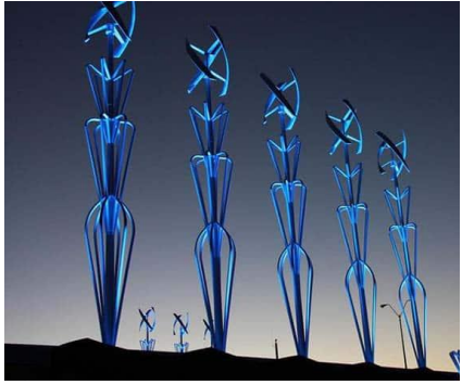
Figure 3. This installation can be found just outside El Paso airport in Texas. It consists of an array of 16 15ft vertical wind turbines. Each is lit from below with LED lights. The lights can even be programmed to celebrate the seasons or other events in the area.