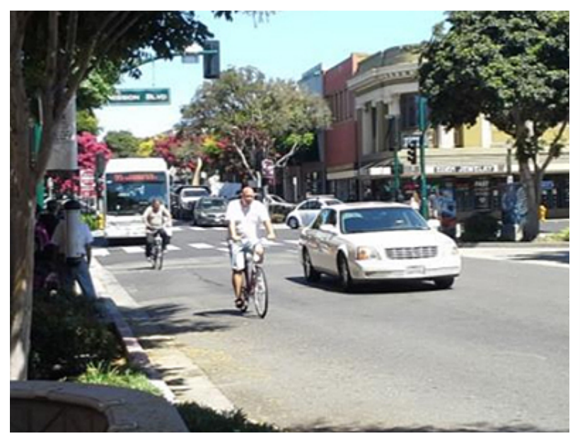
Multimodal activity in Downtown Hayward