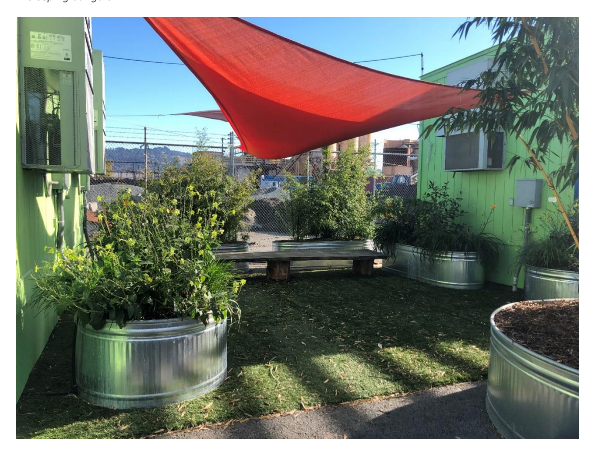
8. Rest/common area