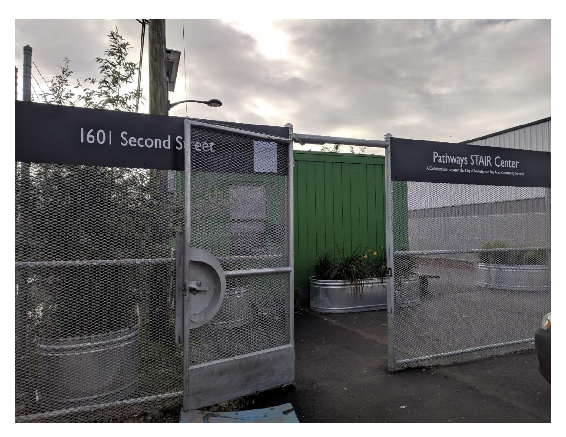
1. Pathways STAIR Center Entrance