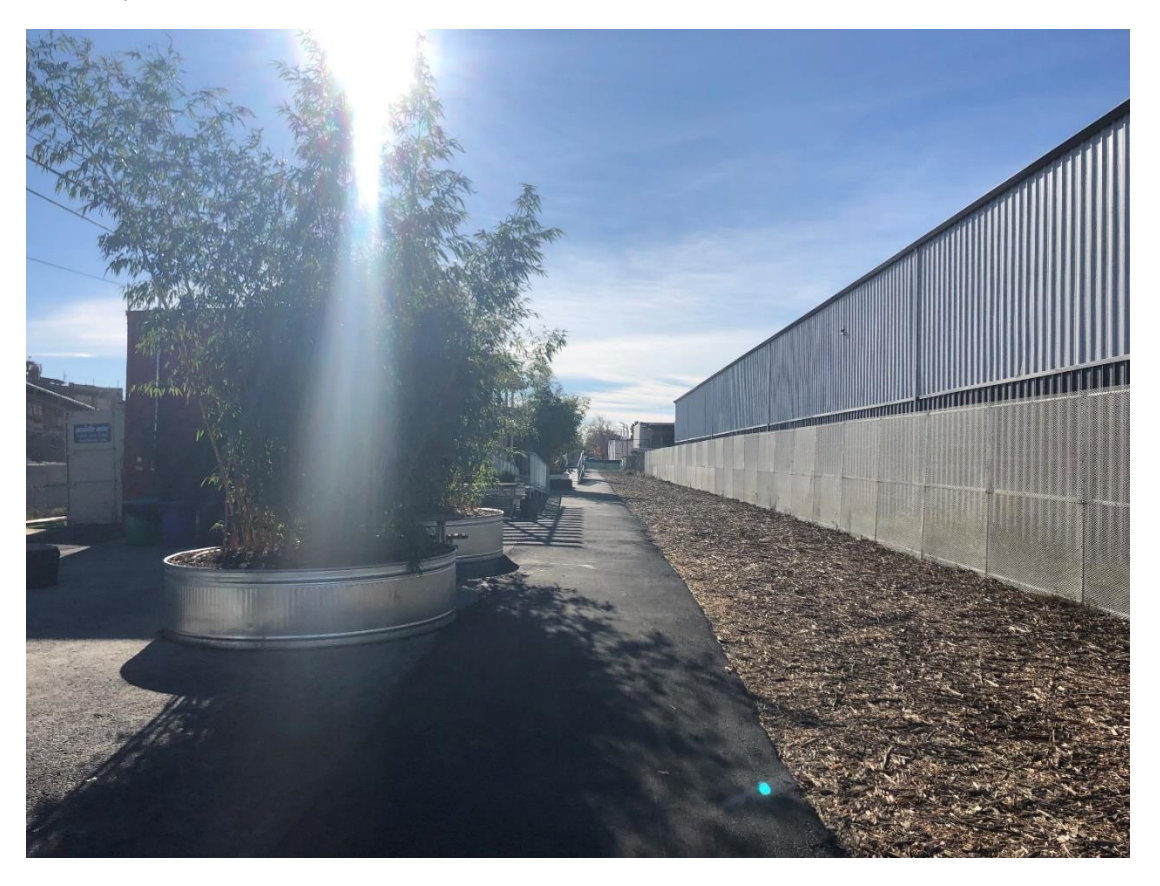
2. Length of STAIR Center (1 city block)