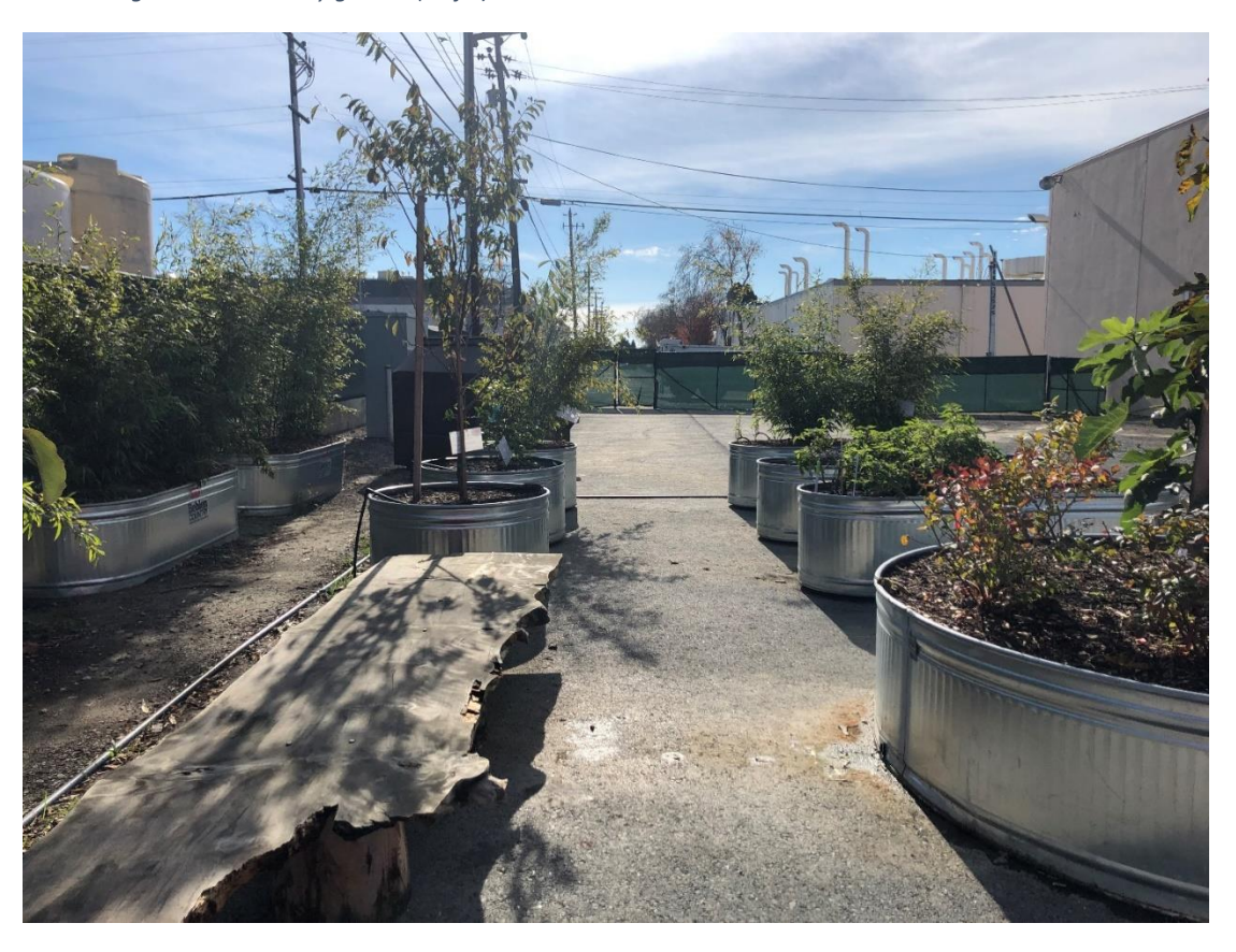
12. Rest/common area in garden