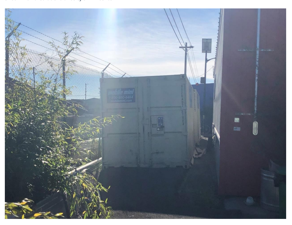
4. Storage unit