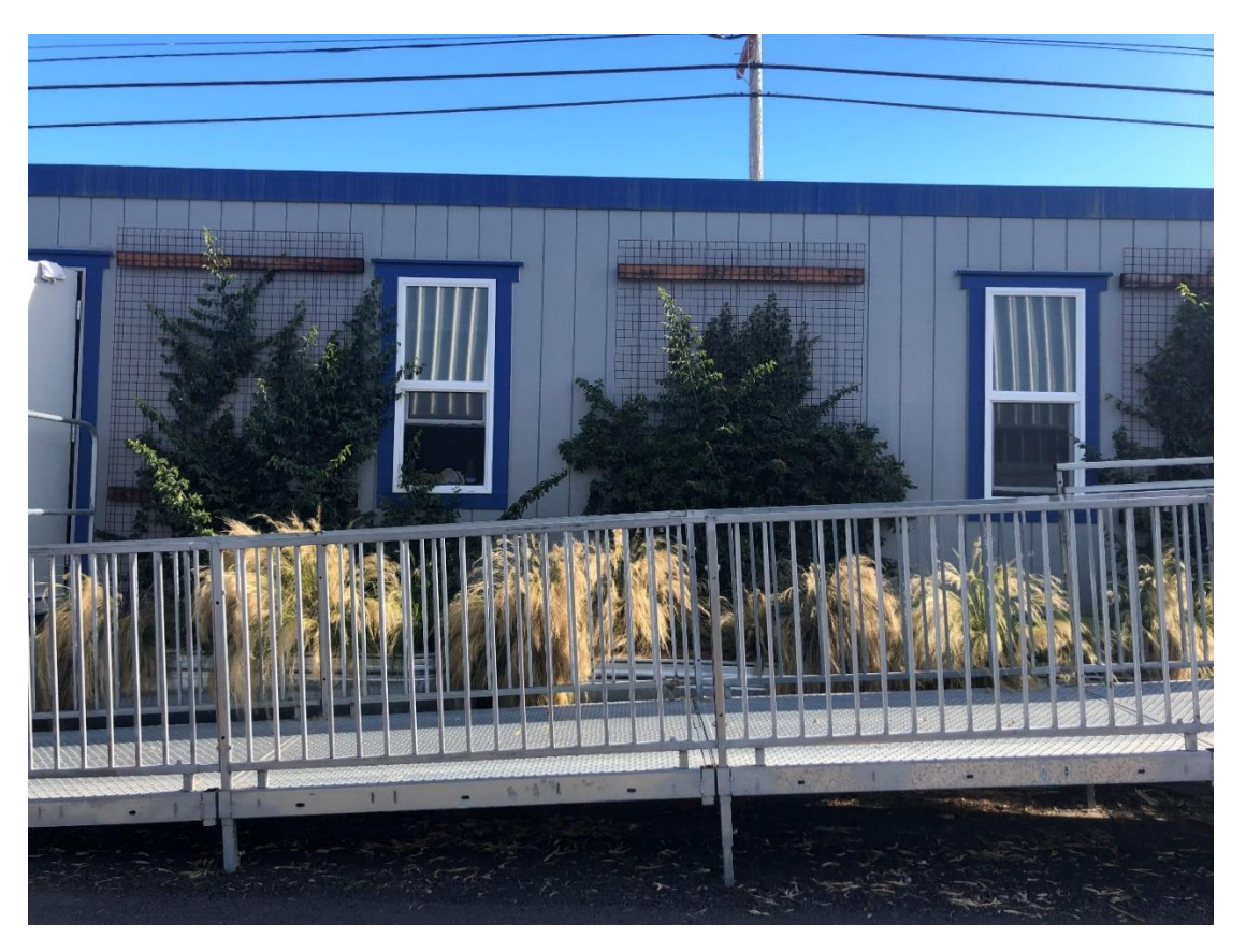
7. Sleeping bungalow