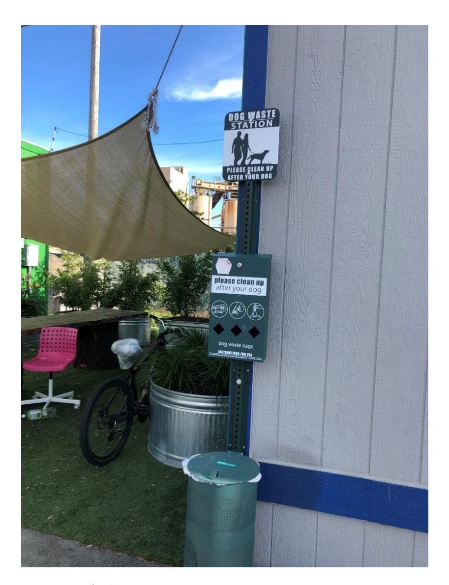
13. Provisions for dog owners