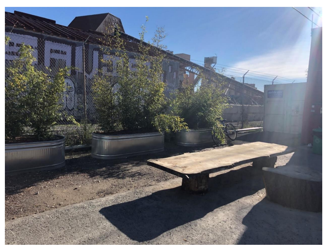
3. Common area at entrance of STAIR center