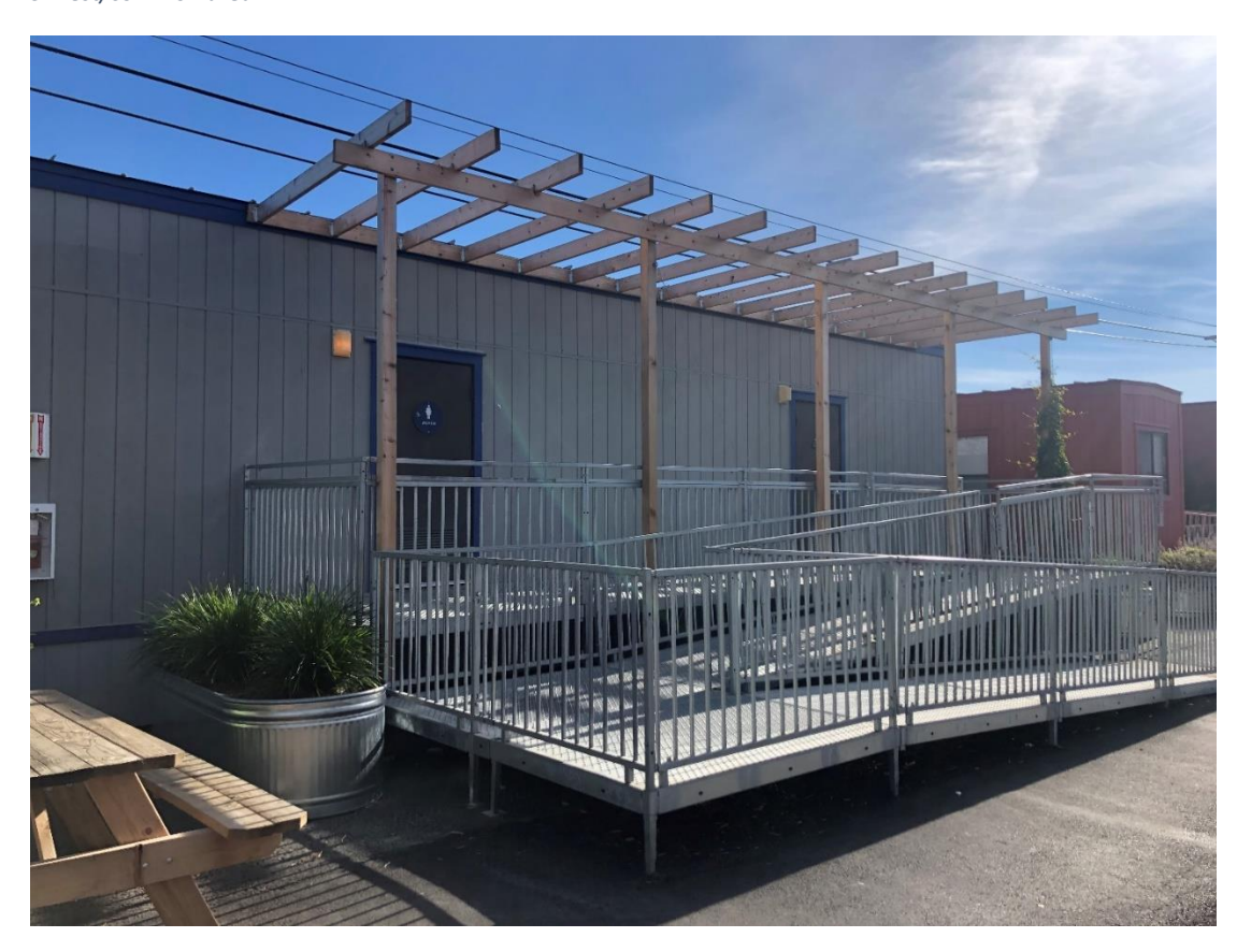
6. Community restrooms