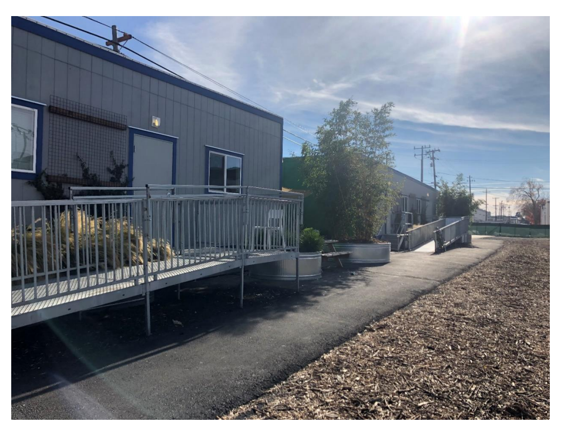
9. Sleeping bungalow and community bungalow