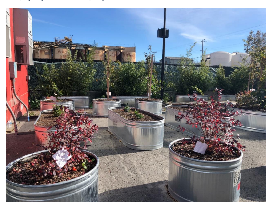
10. Above ground community garden (1 of 2)