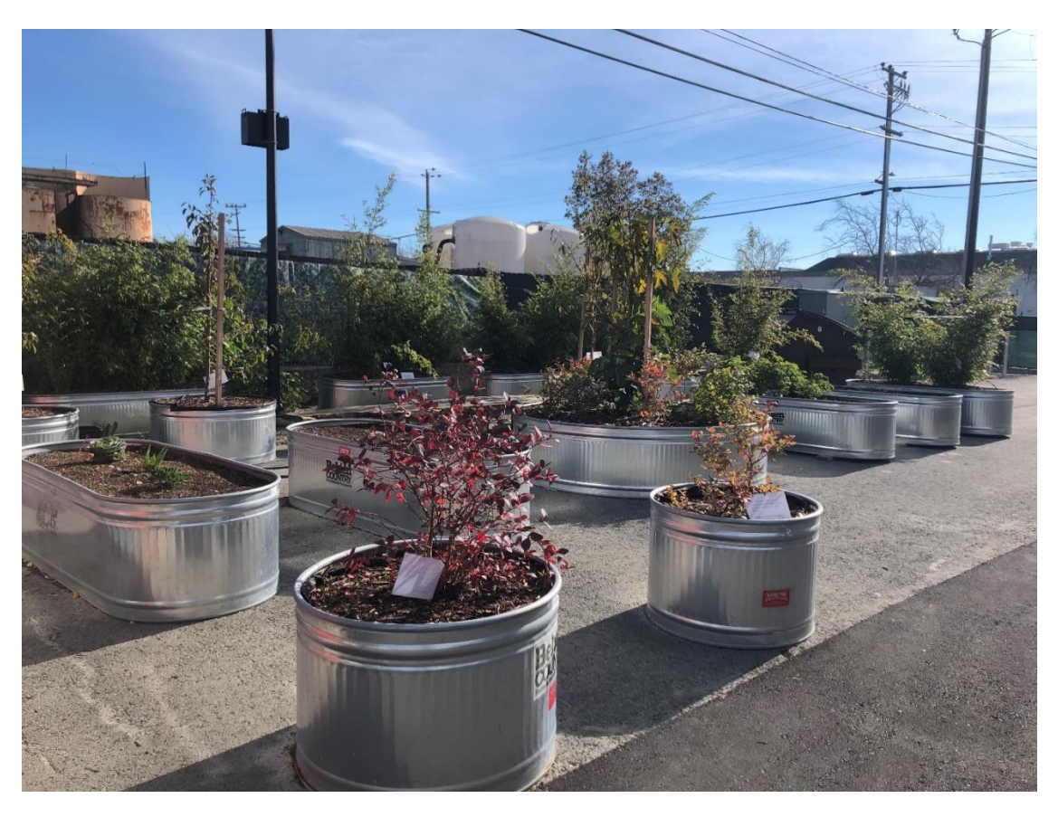
11. Above ground community garden (2 of 2)