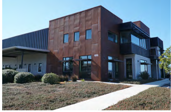
Pedestrian pathways are easily identifiable and connect the building to parking areas and off-site sidewalks.