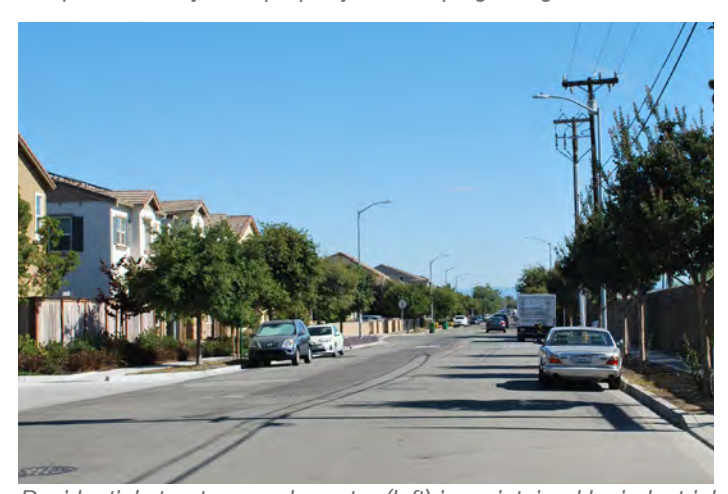
Residential streetscape character (left) is maintained by industrial properties (right) through consistent tree and shrub type and placement.