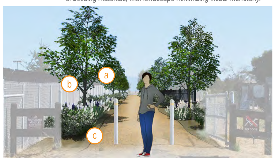
Example landscaping adjacent to open space, trails, or trail access.