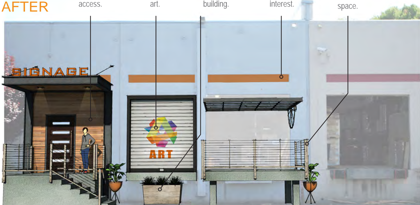
Street facing facade improvements that could occur to create and enhance visual interest.

Deck creates usable employee or customer space.