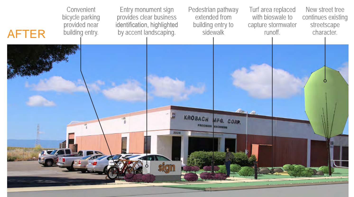
Site element improvements that could occur to enhance visual interest and minimize visual impact at the street frontage.