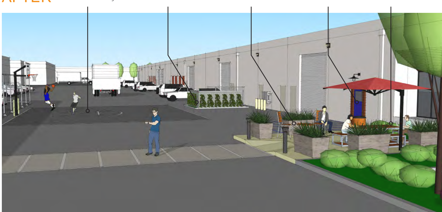
Employee amenity improvements that could occur to enhance visual interest and otherwise meet the intent of design and development requirements.