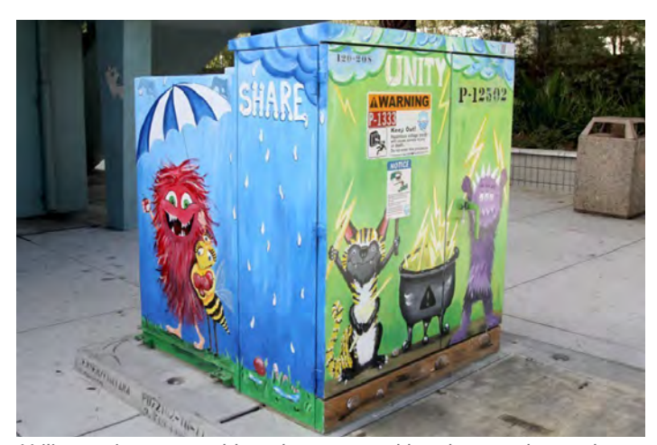
Utility equipment unable to be screened has been enhanced through an art mural.