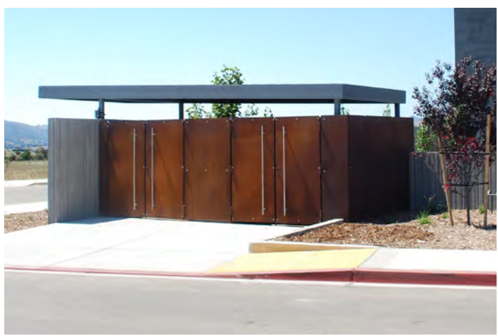
Trash enclosure providing pedestrian entries enhances ease of use.