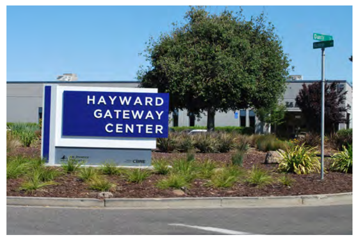
Project signage coordinated with overall colors and materials palette for the project.