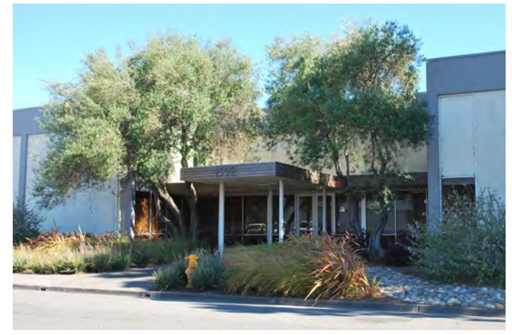
Accent landscaping utilized to create visual interest and highlight primary building entry.