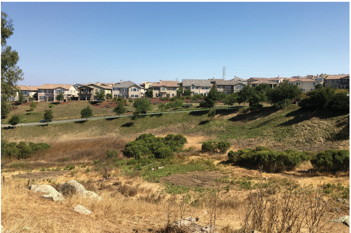
PHOTO 2: View from the project site looking northeast at the adjacent development, Stonebrae Country Club, and drainage basin below Stonebrae Road.