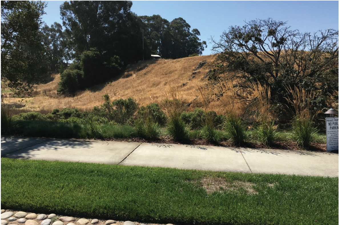
PHOTO 3: View of the project site from Stonebrae Road looking south.