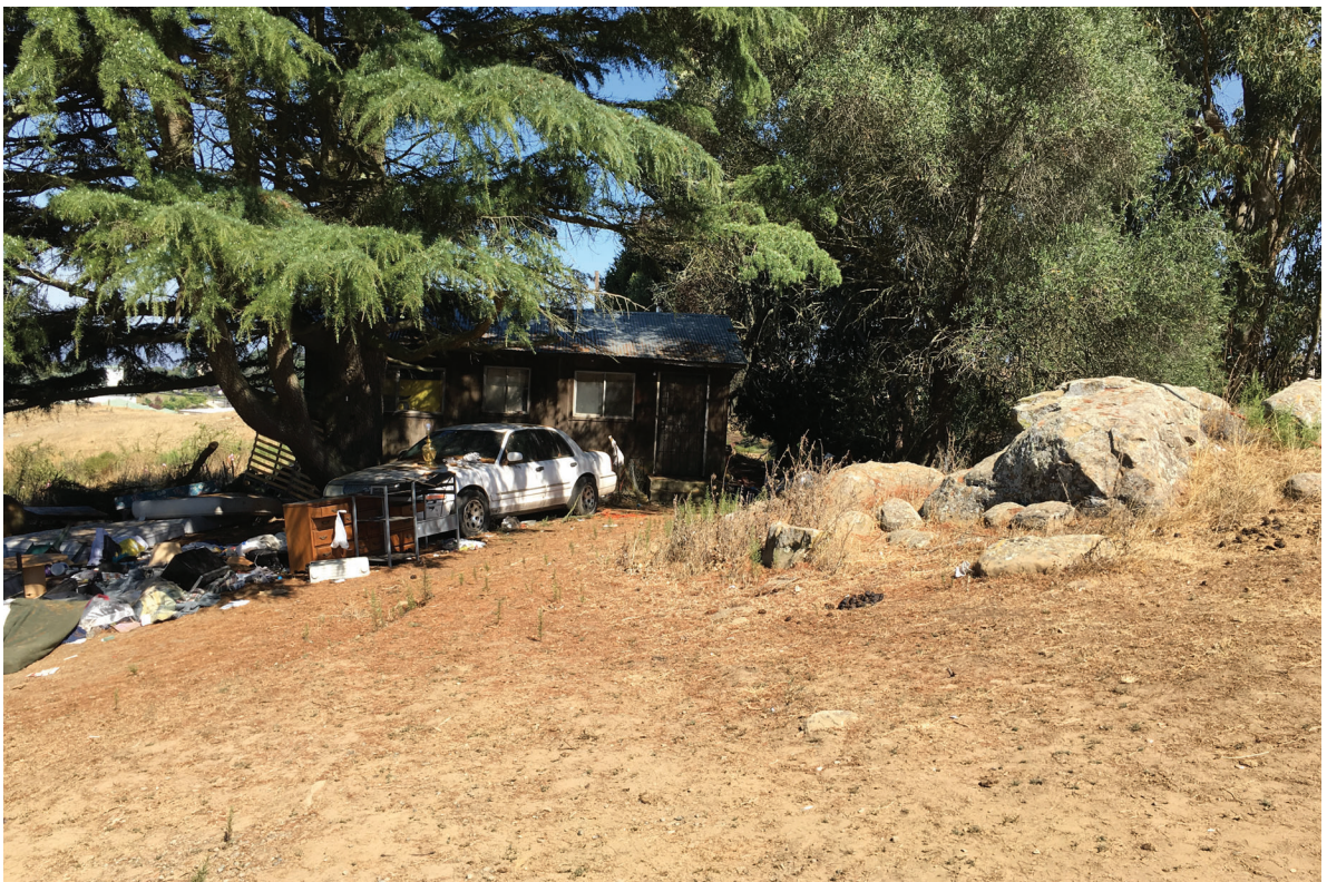
PHOTO 4: View of the existing home on the eastern portion of the property facing north.