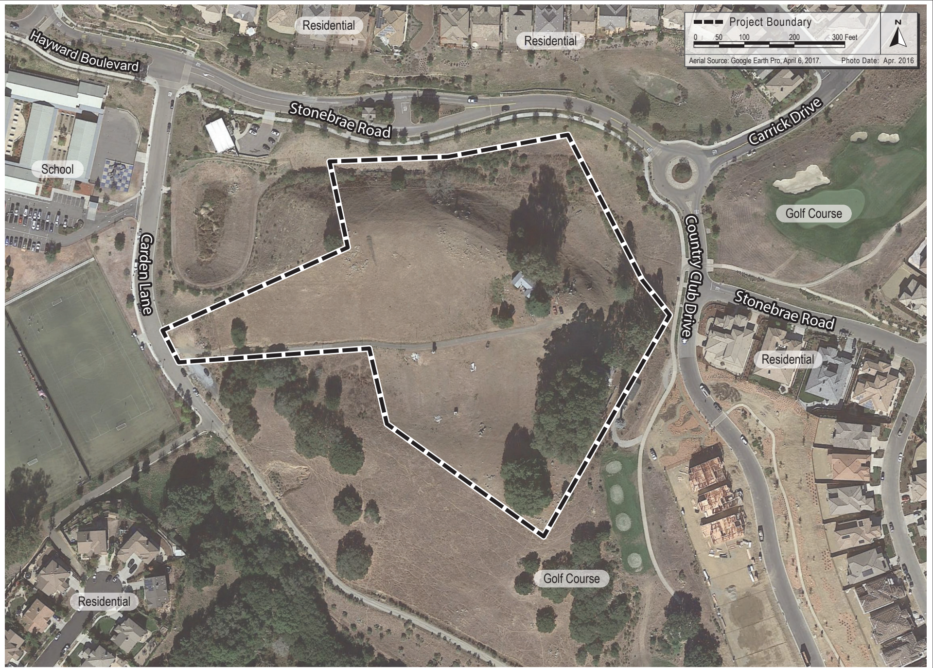
AERIAL PHOTOGRAPH AND SURROUNDING LAND USES