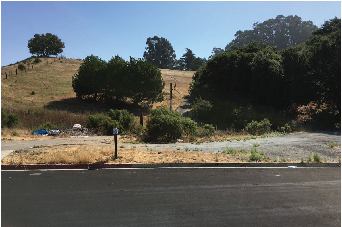
PHOTO 1: View of the project driveway from Carden Lane looking east.