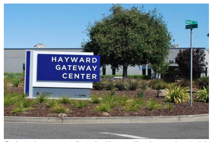
Project signage coordinated with overall colors and materials palette for the project.