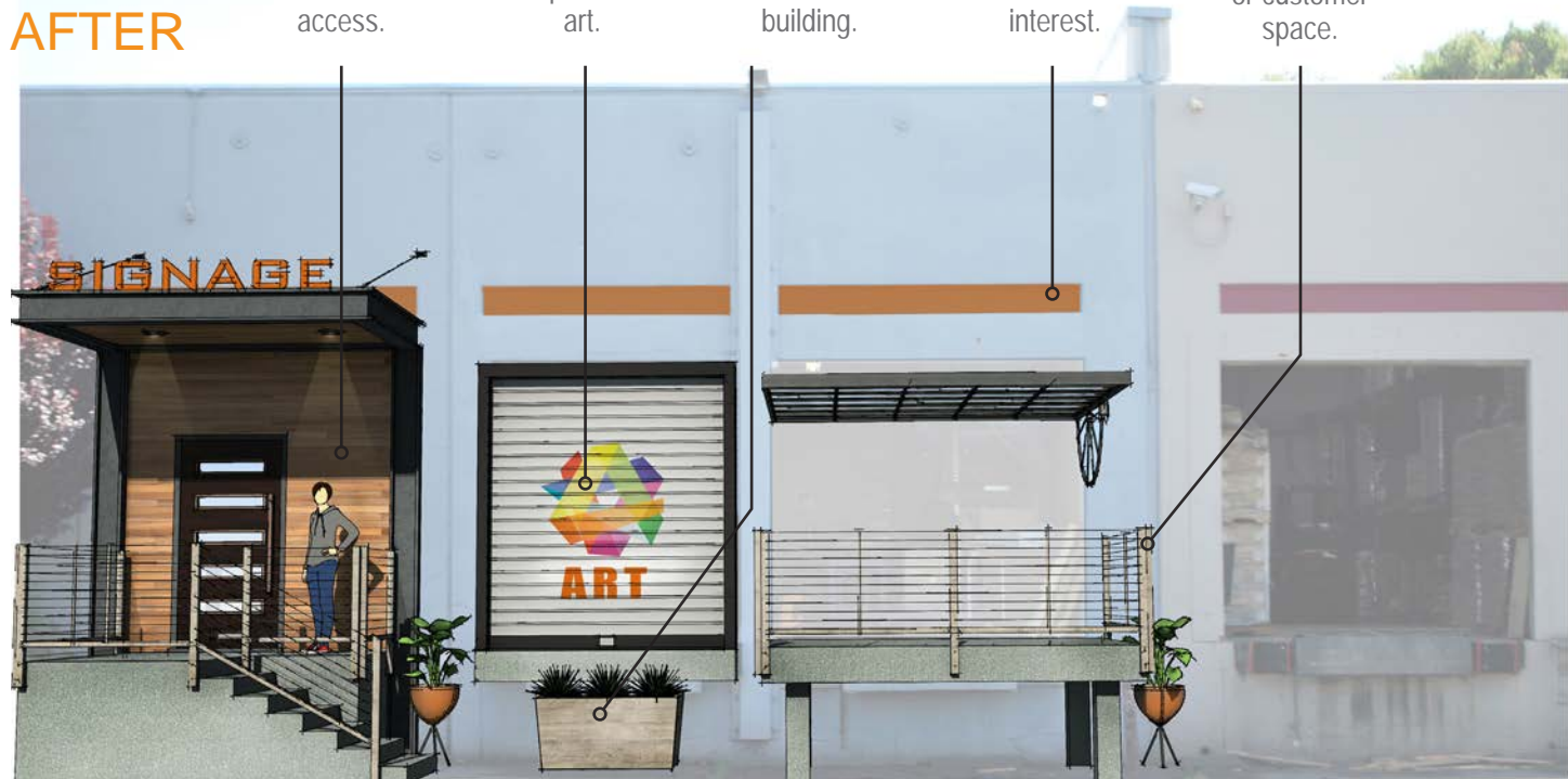
Street facing facade improvements that could occur to create and enhance visual interest.

Deck creates usable employee or customer space.