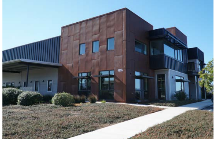
Pedestrian pathways are easily identifiable and connect the building to parking areas and off-site sidewalks.