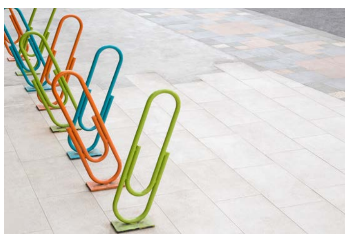
Bicycle rack placed near primary building entry as unique feature that complements adjacent business.