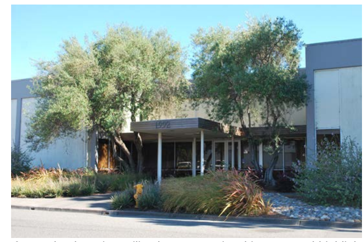
Accent landscaping utilized to create visual interest and highlight primary building entry.