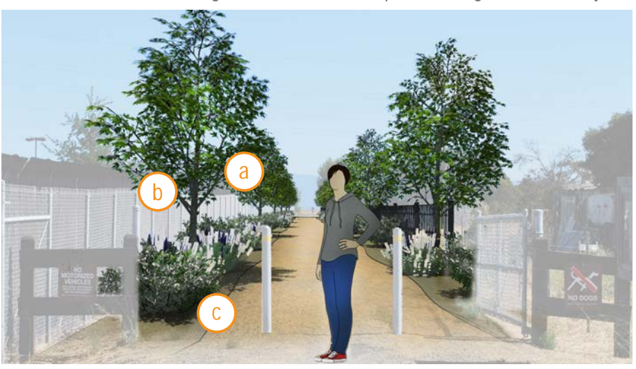
Example landscaping adjacent to open space, trails, or trail access.