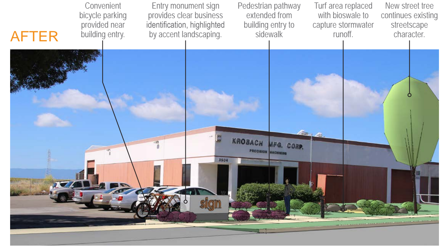
Site element improvements that could occur to enhance visual interest and minimize visual impact at the street frontage.