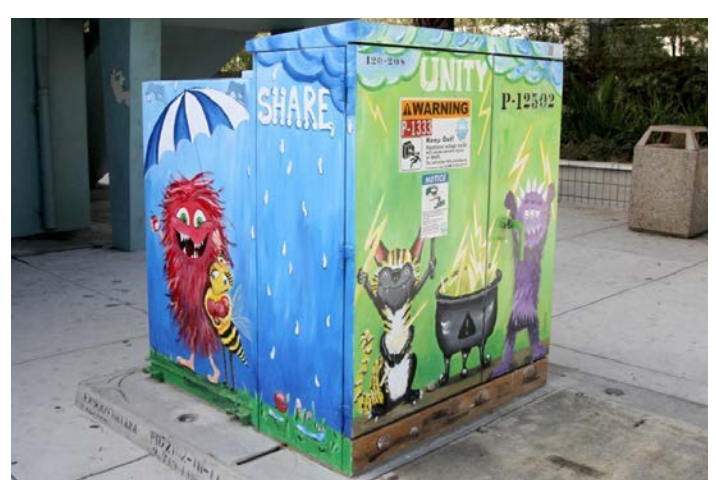
Utility equipment unable to be screened has been enhanced through an art mural.