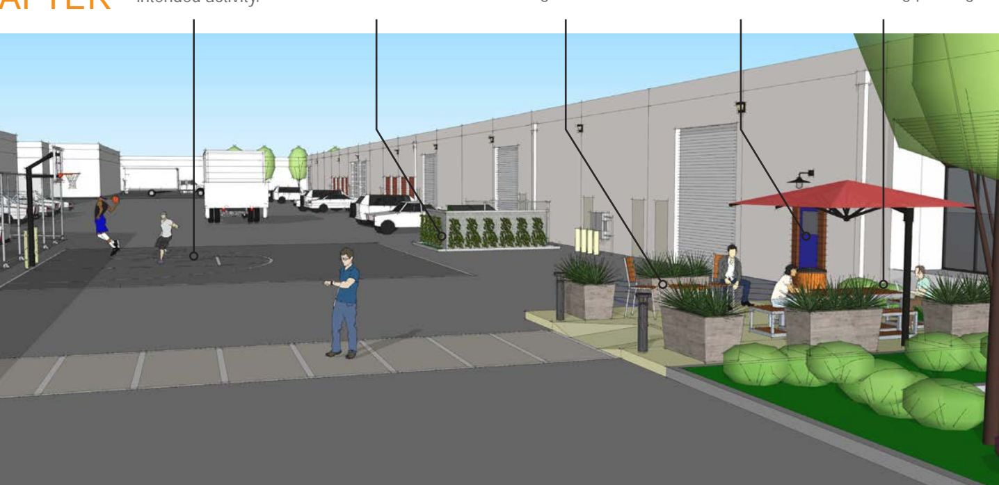
Employee amenity improvements that could occur to enhance visual interest and otherwise meet the intent of design and development requirements.