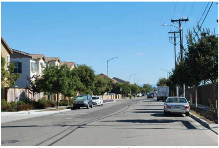
Residential streetscape character (left) is maintained by industrial properties (right) through consistent tree and shrub type and placement.