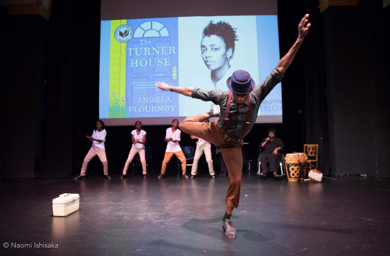
ABOVE: Seattle Reads The Turner House performance by Northwest Tap Connection.