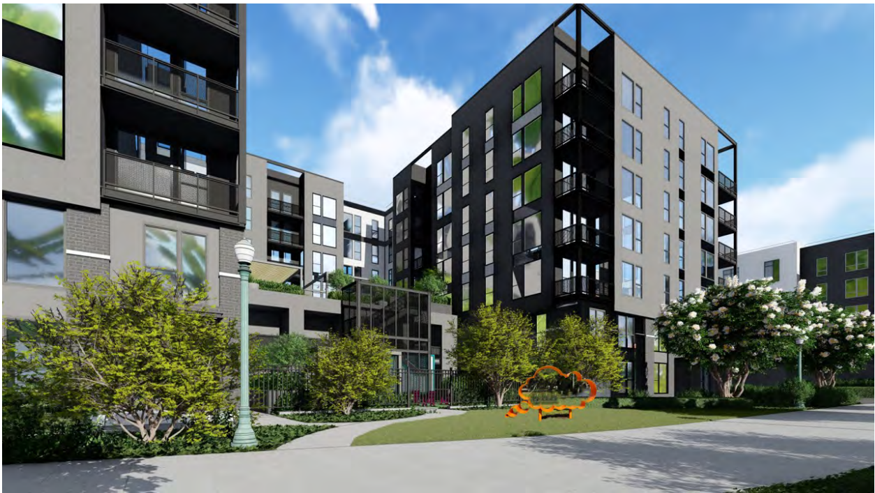
Hank Willis Thomas' Saverio and Daisy (Navel) is a function bench that is placed along the greenway path.