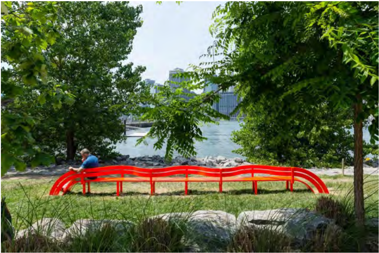
Jeppe Hein's Modified Social Bench #12 is a functional sculpture that will be placed along a greenway path.