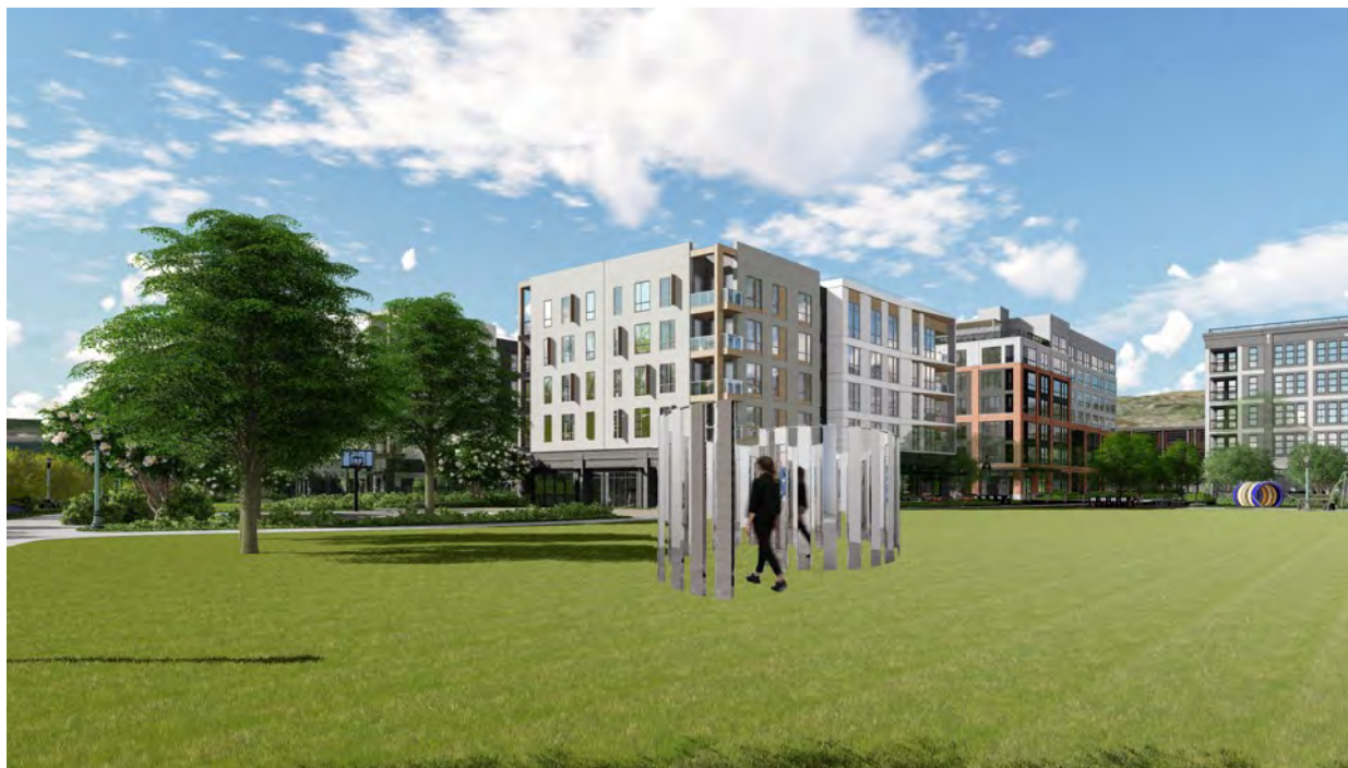
Jeppe Hein's Your Way , is a labyrinth style interactive sculpture to be installed in the City park parcel.

LMC is currently developing a mixed-use community that will be home to 500 new apartment homes in four distinct highly amenitized buildings, a renovated 74,000 sf existing office building, a brand new 2+ acre public park, and ground floor neighborhood serving retail that will cater to the new residents and to the greater community. Artsource Consulting is guiding LMC through their public art ordinance requirement that includes a private/city partnership with a separate approvals process. This project includes 4 sites of free-standing public art to be incorporated throughout the multi building development. Artsource Consulting is handling all phases of the project from artist search and selection, the city approvals process, and managing the artwork timeline for all of the pieces.