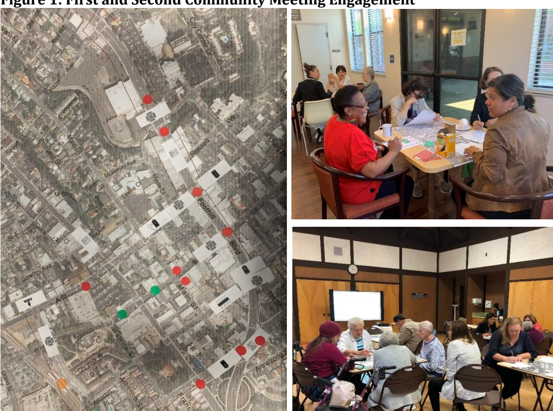
Figure 1: First and Second Community Meeting Engagement

After analyzing results from the community meetings and collision data, staff prioritized the intersections located in the study area and narrowed down the scope to five signalized and one unsignalized intersections. The selected six intersections are shown below: