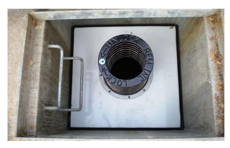
Figure 3: Small Trash Capture Device within Storm Drain

The MRP 3.0 draft is projected to be adopted July 1, 2021. As currently drafted, the trash reduction requirements are revised to extend the 100% trash reduction compliance to July 1, 2025; however, the draft also includes a change in the calculation of trash reduction credits,