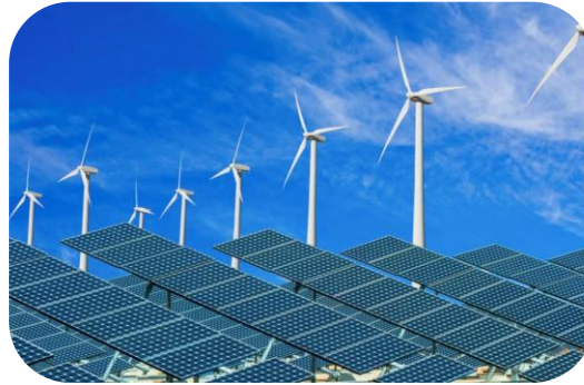
Energy Reform Package