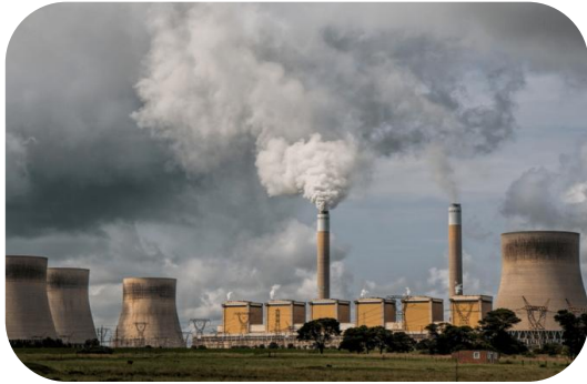
Cap and Invest Reauthorization