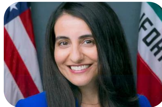
New Senate Leadership